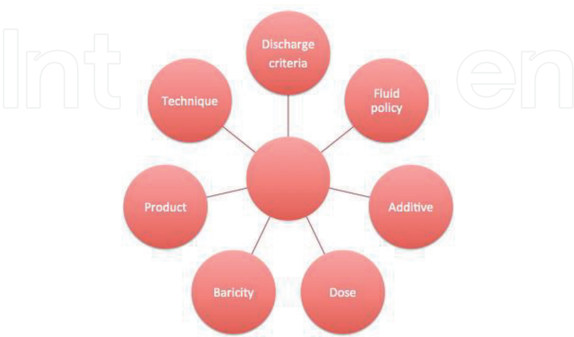
Figure 1. Variables in spinal anaesthesia for day-case surgery.

Different aspects of spinal anaesthesia can be modified ( Figure 1 ). Changing the solution for spinal injection, the anaesthetic technique or fluid policy can influence the duration of the sensory and motor block, the risk of certain side effects or discharge time. Modifying certain discharge criteria, like the necessity to void, can influence discharge time as well.