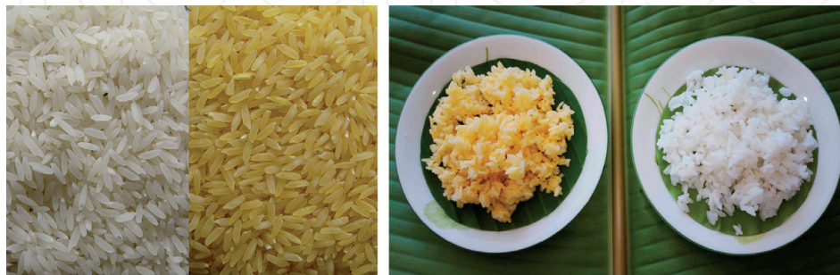
Figure 3. Polished white and Golden Rice and (a different cultivar, after 2 months of postharvest storage) after cooking.

Nevertheless, for Golden Rice ‘from a public health standpoint, for food fortification to be effective’, all the characteristics listed by Dr. Semba are satisfied, except when it comes to ‘undetectable by persons consuming it’. The Golden Rice colour is caused by the \beta -carotene content, a source of vitamin A for humans, which in Golden Rice is about 80–90% of all carotenoids [5]. It is the same \beta -carotene which colours mangos, papaya, squash and carrots, all of which consumers readily accept, and there is no taste associated with the \beta -carotene content. In Golden Rice, the intensity of the colour is proportional to the \beta -carotene content. The colour is obvious and cannot be ignored ( Figure 3 ).