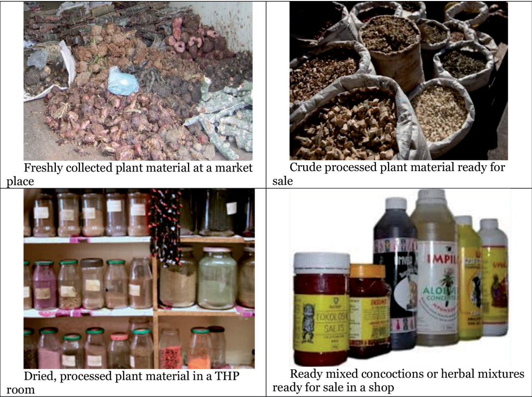
Figure 2. Plant material in various stages of the production: from collection to point of use as a ready-to-use mixture.

measures of the handling of the herbal mixtures during production, storage and dispensing. The South African Health Products Authority (SAHPRA), through its working group, is working on the draft framework for the regulation of ATMs produced for bulk sale [118], and these studies should serve as a guide for fast-tracking the processes ( Figure 2 ).