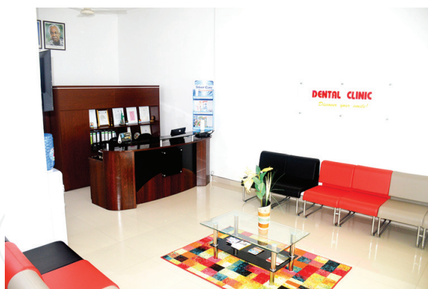
Figure 3. A patient-friendly dental clinic reception (picture by Jacob Francis, courtesy of Smiles dental clinic).