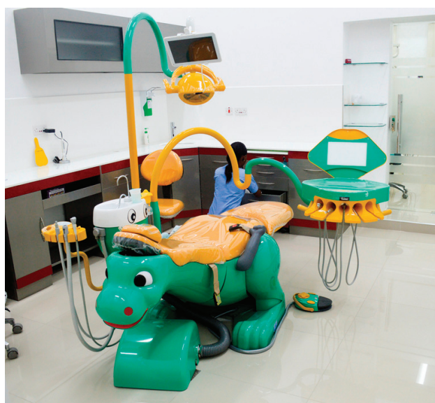
Figure 4. A child-friendly dental surgery.

be effective in reducing state anxiety [49]. Similarly, SDE, which has been utilized and proved to be effective for management of dental anxiety, is also helpful in reducing the anxiety and relaxing the patient [45].