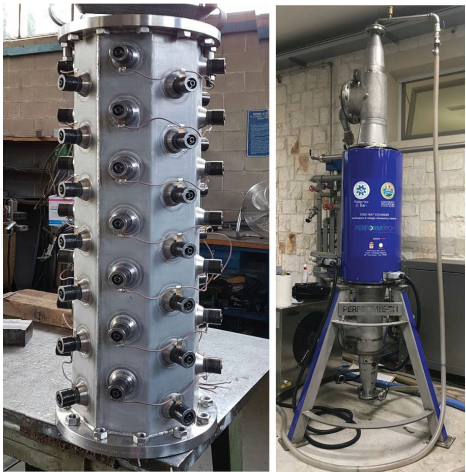
Figure 2. The inner part of the sono-heat-exchanger (on the left). The external structure of the sono-heat-exchanger (on the right).

Ultrasonics also concretely open the way to a production model that, consistent with the principles of circular economy, leads the mills to exploit the potential to