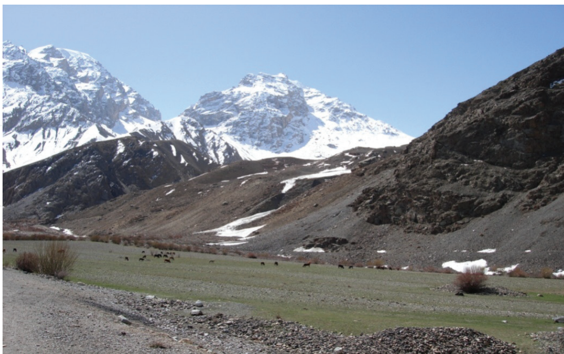
Picture 1. The mountains and valleys of Western Pamir.

took place in two stages. Apricots were known in Italy and Greece as a result of the Roman-Persian wars in the first century BC. The species of Armeniaca suggests that apricots were first brought to Italy and Greece by Armenian traders. This happened much later when the apricot was already grown in other parts of Southern Europe [5].