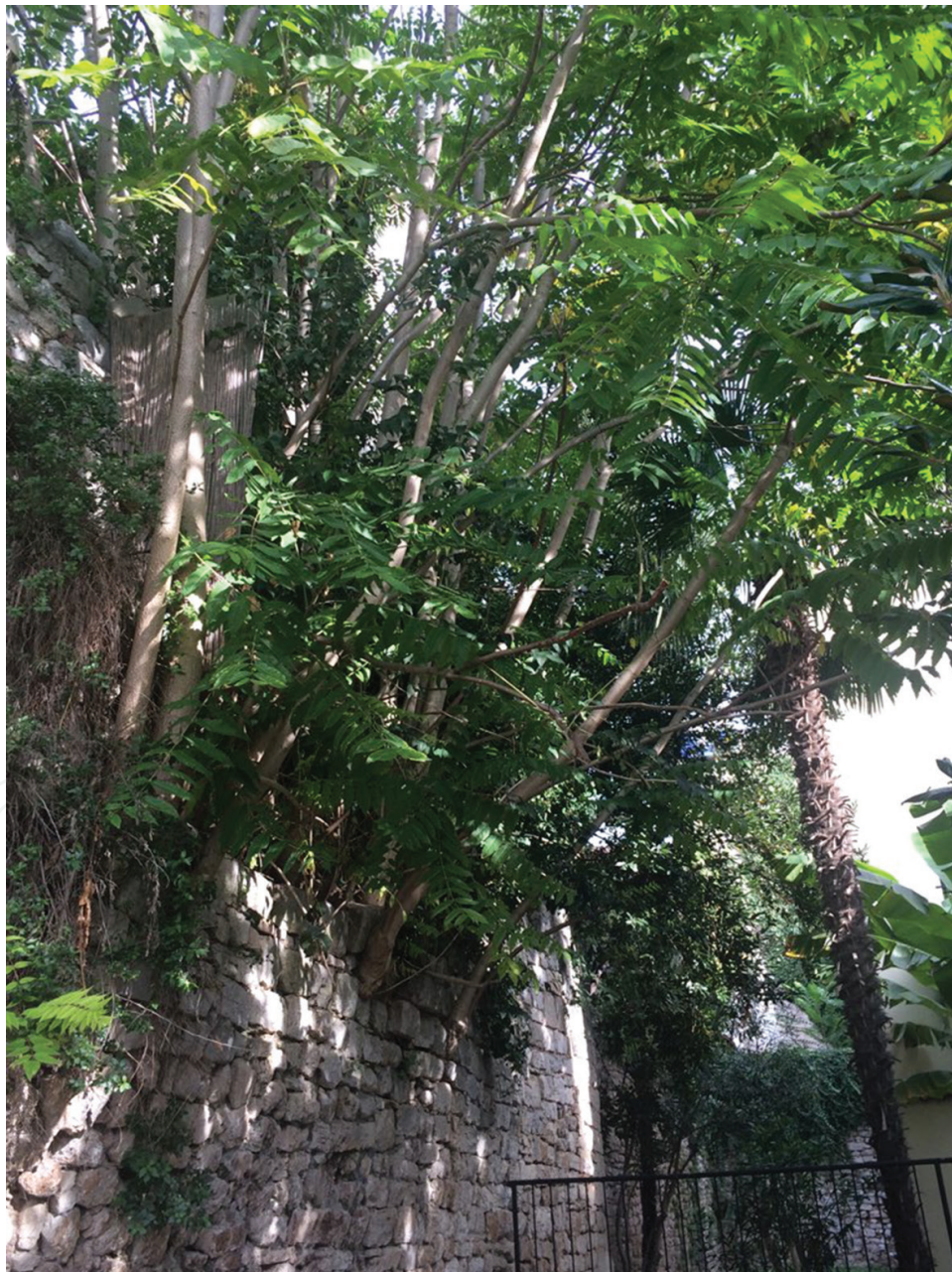
Figure 1. Negative effects of Ailanthus altissima on archaeological sites in Croatia.

The ecological influence of invasive alien species is manifested in different ways. Alien plant species inhabit the area of native species, alter the conditions in their habitat as well as the structure of their communities and interbreed with native species. Alien animal species can also compete for food and shelter with native species and transfer different diseases. Invasive species in general are highly adaptable to a new habitat, tolerate a wide range of climate