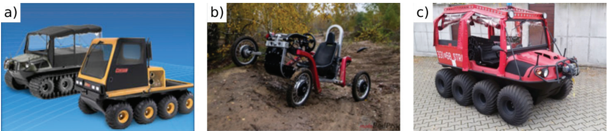
Figure 1. Example of ground units (a) adapted to driving in a complex terrain trailer pulled by Land Rover Defender 110 [3], (b) all-terrain vehicle Swincar [4] and (c) ARGO 8 × 8 amphibious vehicle in a track and wheel version [5].

The application of modern technologies in rescuing is highly desirable. Search and rescue groups, the specific nature of actions of which is connected with carrying out actions in difficult terrain conditions, have been found to have particular needs. Given the increasingly frequent access to modern technologies, more and more frequently use is being made of geolocation technologies, and the usage of unmanned aerial vehicles in actions, and consequently the combination of both strategies seems to be a natural step in the implementation of those solutions in rescue actions. The MOBNET system is implementing this trend by using cellular phone signals, the GALILEO system, the European navigation system to localise signals with an accuracy of even 10 cm and unmanned aerial vehicles. The rate and accuracy of localising offered by the system, which is made possible thanks to the fact that according to the Digital in 2017 Global Overview Report ca. 66% people worldwide use their mobile phones every day, are aimed at finding a tool to support considerable search and/or rescue actions.