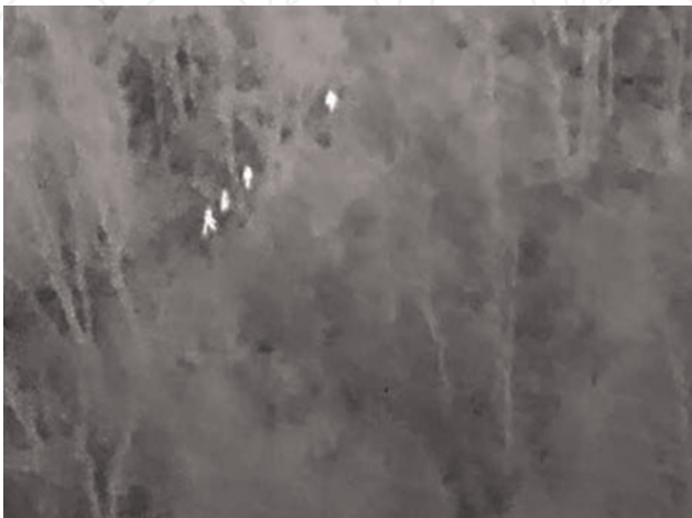
Figure 2. View from thermal vision camera provided on UAV—looking for missing persons [6].