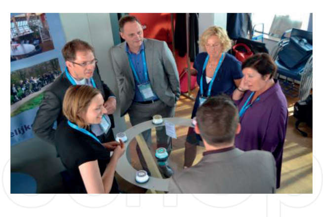
Figure 4. Participants discuss the firstplaced token.