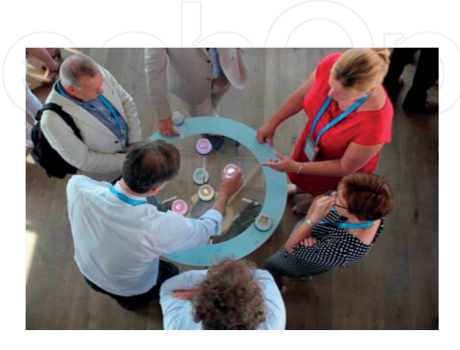
Figure 6. Pointing and repositioning a token to relate it to the others.

The meanings were not limited to definitions of symbols; instead, they were narratives of arguments, anecdotes and interests that were brought to the table by all participants. The eclectic or even conflicting input was not brought to a 'safe middle way' or consensus; instead, the input was tied together as a story, supported by the physical token positions in space, the invisible traces on the table that the visualisation made visible through the digital representation of movements.