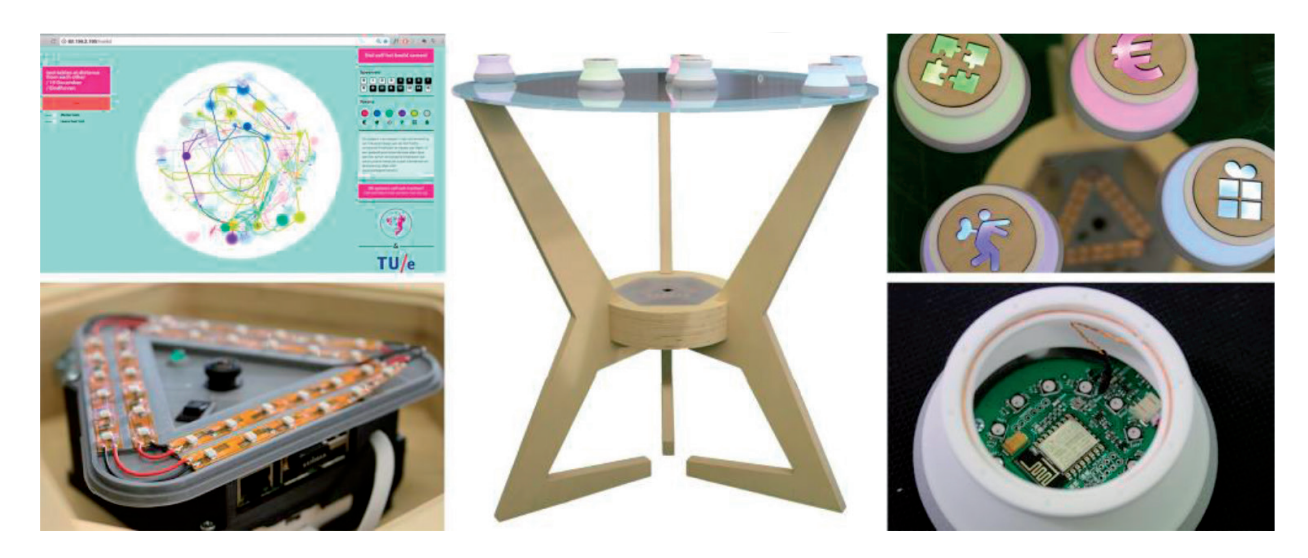
Figure 2. Elements of the [X]CP system, f.l.t.r.: real-time visualisation, table with tokens, symbols on tokens, tracking hardware and token hardware.

The tokens' (marker) positions are tracked by the tables and represented in real-time on a big projected data visualisation. The visualisation shows a helicopter view of the movements of all tokens at all tables and allows filtering between them, to discover patterns in movements, relative distances, centrality on the table or amount of touches. By showing alternative views