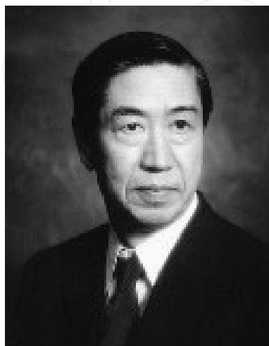
Figure 2. Dr. G. Taguchi [17].

This moved Taguchi to develop new optimizing methods of the processes of engineering experimentation. He believed that the best way to improve quality was to design and build it