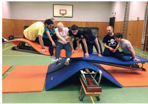
Figure 2. The seesaw: a group activity in psychomotor therapy.

goal. Other group members intrude into their comfort zone, and the patients are confronted with body contact. For some patients, this is a stress situation. How can they cope with this stress?