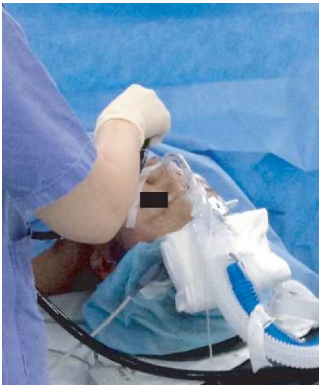
Figure 7. Transnasal intubation in upper GI NOTES. The patient was placed in the supine position and intubated via a nasal RAE™ tracheal tube. The endoscopic operator stood near the head of the patient and inserted the endoscope via the mouth (Ji Hyeon Lee et al. 2014)