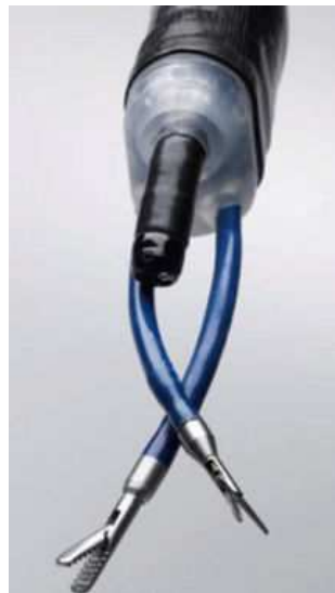
Figure 6. Direct Drive Endoscopic System (DDES), S Shaik et al. 2010

third point is to monitor ETCO 2 [66], (figure 7). For other NOTES accesses, transnasal intubation is not necessary. Anaesthetic technique can be different from laparoscopic surgery. The effect of pneumoperitoneum may be not different; both techniques will have pneumoperitoneum if it is abdominal NOTES procedure. POEM procedure, for example, does not need pneumoperitoneum [67, 68]. Any patient that cannot tolerate pneumoperitoneum because of cardiopulmonary disease is not a candidate for NOTES procedure. Cardiorespiratory physiology is affected by laparoscopic procedure mainly because of pneumoperitoneum. However, the non-inferiority of NOTES compared to the laparoscopy is demonstrated from reported studies, although the evidence is limited by a number of researches [69]. When administering anaesthetic care to a patient undergoing NOTES, anaesthesiologists should closely monitor the patient's position as well as ETCO 2 to minimise the incidence of mediastinal emphysema and pneumomediastinum and to ensure early detection of pneumoperitoneum-related respiratory and hemodynamic changes [70].