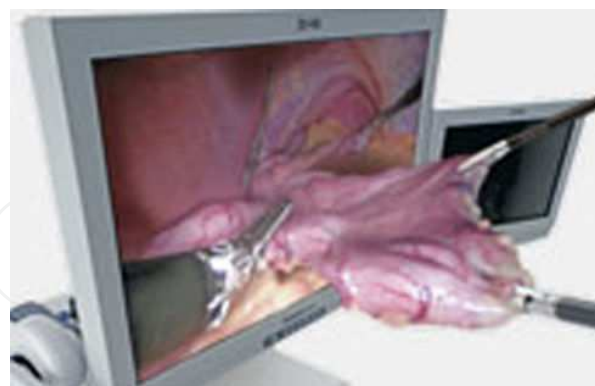
Figure 4. Aesculap’s EinsteinVision® system