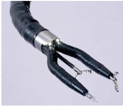
Figure 5. EndoSAMURAI platform, Yasuda K et al. 2014