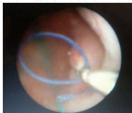
Figure 3. Vicryl loop closure of transvesical access (J Bhullar et al. 2012)