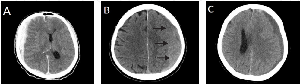
Figure 2. CT images with an acute SDH, <3 days old, hyperdens (A), subacute SDH, 3 days to 3 weeks old, isodens (B), and cSDH, >3 weeks old, hypodens (C)