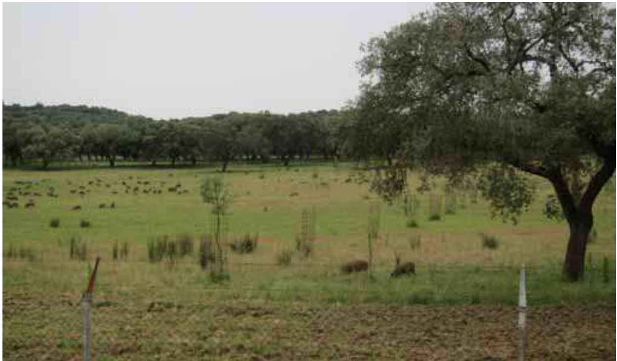
Fig. 11. Iberian growers grazing in a reforested dehesa at the end of spring (Natural Park “Sierra Norte de Sevilla”, included in the Biosphere Reserve “Dehesas de Sierra Morena”). The perimeter fence and a firebreak are in the first line of the picture.