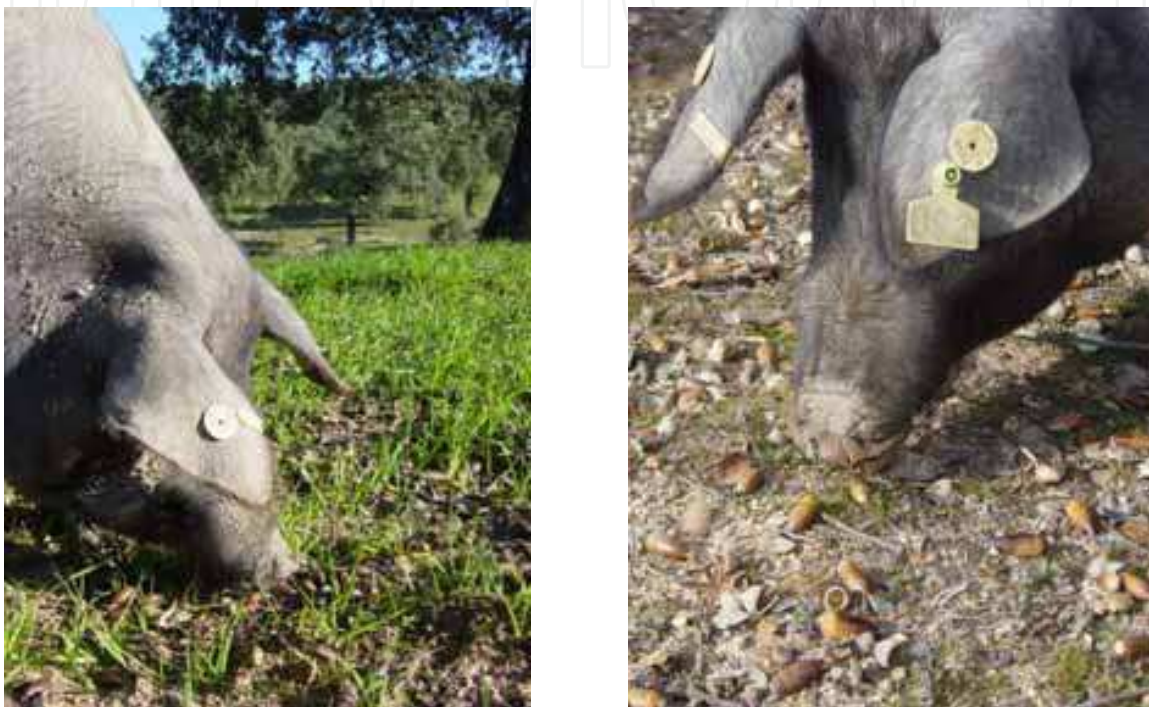
Fig. 8. Iberian fatteners foraging acorns in a dehesa during montanera (from November to February) under the control and inspection of the Denomination of Origin "Los Pedroches" (Turcañada S.L., dehesa Casa Alta, Fuente Obejuna, Córdoba, Spain).

hence, pigs are entirely dependent on natural resources during this finishing period, of at least 2 months. Studies, based on direct and continuous in situ observations of ingestive bites taken by continuously monitored pigs (during 10 uninterrupted hours per day of observation), show that the Iberian pig montanera diet is based on acorns and grass with 56.5 and 43.3% of grazing bites respectively; while only other nine resources (berries, bushes, roots, carrion, straw, etc.) were consumed at a frequency \geq 0.01\% (Rodríguez-Estévez et al., 2009a). This means a daily intake of 1251 to 1469 acorns or 7.13 to 8.37 kg of whole acorn and 2 to 2.7 kg of grass, during 6.1 to 7.1 foraging hours (Fig. 8).