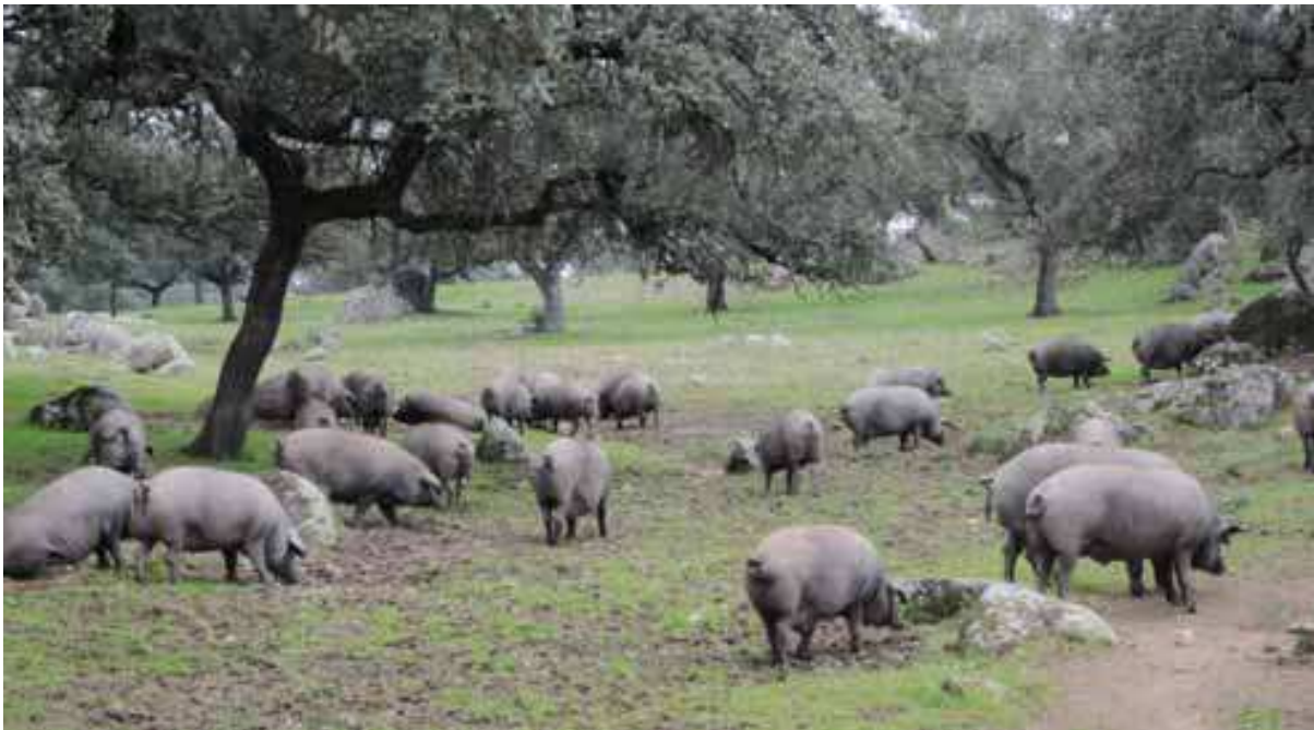
Fig. 9. Iberian fatteners foraging acorns in a dehesa in winter, close to their slaughtering (dehesa Navahonda Baja, Natural Park “Sierra Norte de Sevilla”, included in the Biosphere Reserve “Dehesas de Sierra Morena”).

mean weights of 5.73\pm0.37 , 6.93\pm0.28 g were rejected and sought after, respectively, at the montanera start (November), and those weighing 3.18\pm0.2 and 3.44\pm0.11 g were rejected and sought out, respectively, at the end (February).