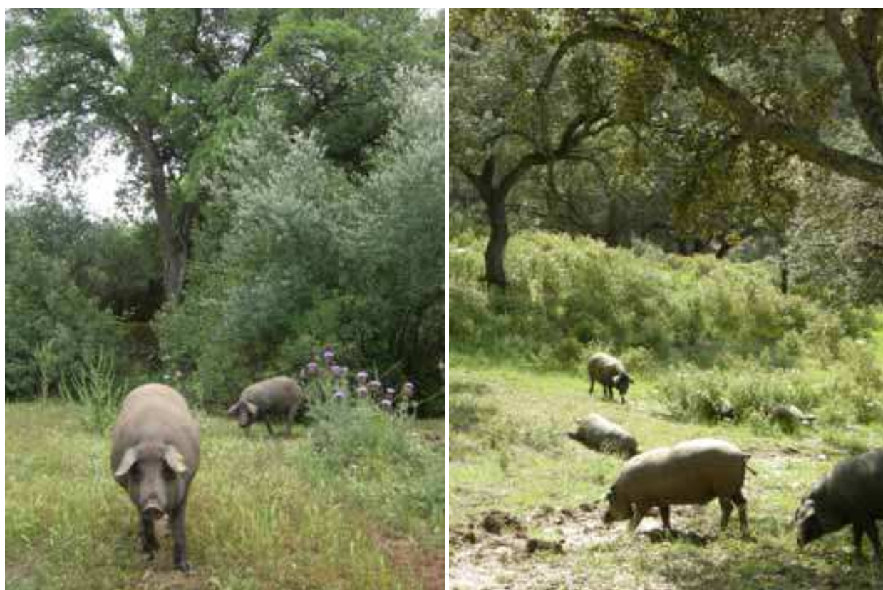
Cork tree ( Quercus suber ) at the bottom and wild olive tree ( Olea europaea sylvestris ) on the right of the image. Evergreen oaks ( Quercus ilex rotundifolia )

(Baldock et al., 1993; Telleria and Santos, 1995; Díaz et al., 1997; Rodríguez-Estévez et al., 2010a). Thirty percent of the vascular plant species of the Iberian Peninsula are found in the dehesas (Pineda and Montalvo 1995). Marañón (1985) discovered 135 species on a 0.1 ha plot in a dehesa in Andalusia and considered the dehesa one of the vegetation types with the highest diversity in the world at this scale, having the highest one between the Mediterranean ecosystems (Fig. 5). Dehesas are the habitat of several species which are rare or globally threatened including black vultures ( Aegipius monachus ), Spanish imperial eagles ( Aquila adalberti ) and Iberian lynx ( Lynx pardina ); besides 6 to 7 million woodpigeons ( Columba palumbus ), 60000 to 70000 common cranes ( Grus grus ), both of them with diets based on acorns, and a large number of passerines depend on the dehesas as their winter habitat (Tellería, 1988).