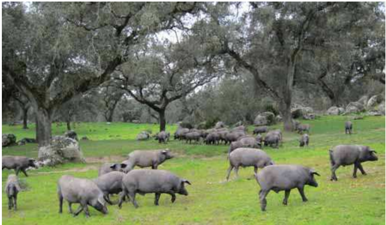
Fig. 7. Iberian growers foraging the remains of acorns in a dehesa at the end of winter, which will be slaughtered after their second montanera , around 10 months later ( dehesa Navahonda Baja, Natural Park “Sierra Norte de Sevilla”, included in the Biosphere Reserve “Dehesas de Sierra Morena”).

Nowadays, the batch for montanera finishing is usually the youngest one and it is pure Iberian breed; while piglets born in December-January are Duroc-Jersey crossbred intensively and fed with formulated compound feed. On the other hand, the montanera finishing system has its own legal regulation (MAPA, 2007), and it does not allow to begin finishing at an age lower than 10 months and limits the beginning weight from 80.5 to 115 kg; besides, it establishes that pigs should gain a minimum of 46 kg (4 arrobas ; 1 arroba is a Spanish measure equivalent to 11.5 kg) grazing natural resources (mainly acorns and grass) during a minimum of 2 months.