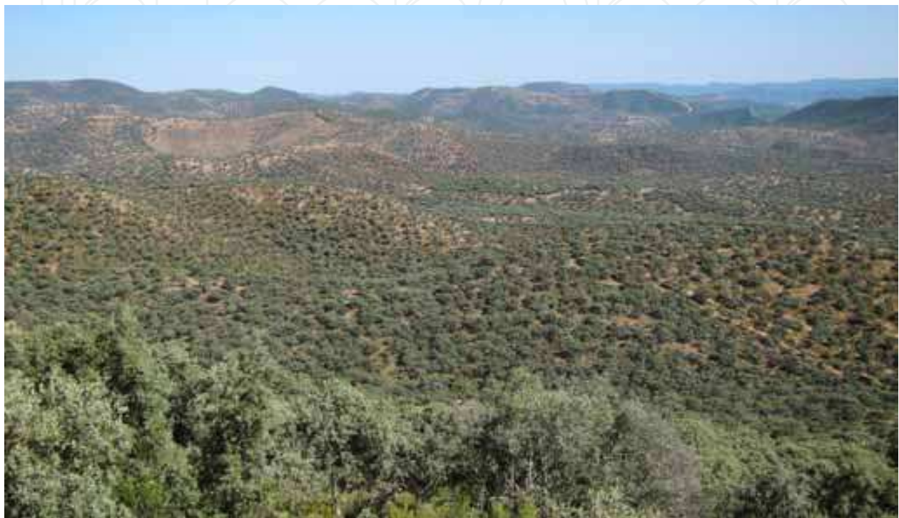
Fig. 2. Aerial view of an area of dehesa (Summer 2011, Fuente Obejuna, Córdoba, Spain); at the bottom of the image is the Natural Park “Sierra de Hornachuelos”, included in the Biosphere Reserve “Dehesas de Sierra Morena”.

2010). Viera Natividae (1950) proposes an ideal tree cover of 2/3 of the land for Quercus suber , while Montoya (1989) indicates a maximum of 1/3 for Q. ilex . These proportions match up with the number of good producer trees that are naturally present in the Quercus mass of the Mediterranean forest, and with the usual densities of the good pannage dehesas (Montoya and Mesón, 2004). Montero et al. (1998) show that the highest production of grass and acorns in the dehesas of Quercus ilex and Q. suber is reached when the tree density equivalent canopy cover of 30-50% is achieved.