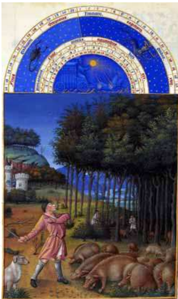
Fig. 10. Calendar page for November of “Les Très Riches Heures du Duc de Berry” (France, 1410-1416).

In a past, there were similar pig fattening systems to the Iberian pig one in other European countries (Fig. 10). For example, in Great Britain, the Common of Mast was the right to turn out pigs during a season known as pannage, and it has survived in the New Forest; but finishing only 500-600 pigs per year. However, in other countries, the pig presence and its grazing and rooting habits became considered dangerous to the forests. Hence, the Iberian one is the only pig breed known which contributes to conservation of an ecosystem, considered a sustained production and a model for organic farming (freedom, welfare, and grazing diet without any chemical supplement). A very low stocking rate and a well conserved dehesa are necessary conditions to finish Iberian pigs grazing acorns and grass. These are the reasons because its contribution to conserve natural areas and to rural development is recognized by the Spanish authorities (MAPA, 2001 and 2007).