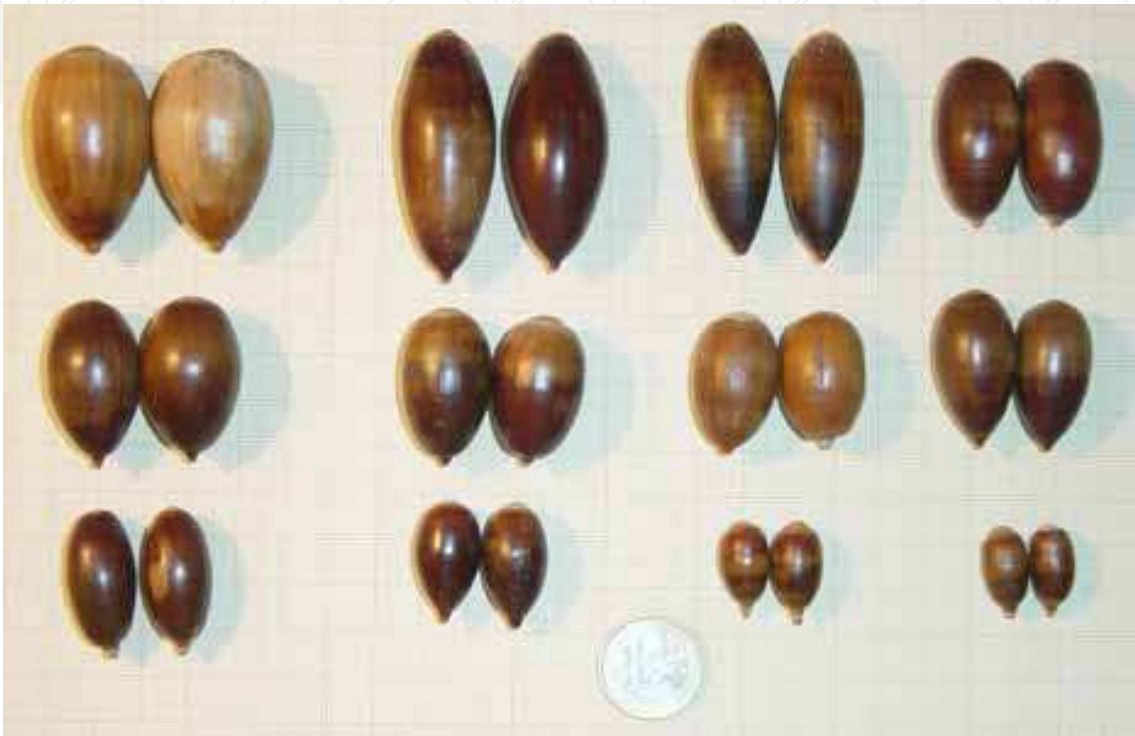
Fig. 6. Acorns of evergreen oaks ( Quercus ilex rotundifolia ) found under 12 different close trees in a dehesa (the coin is an Euro).

There is a high intraspecific variability in acorn traits and they account for 62% of the variance of the biomass of acorns (Leiva and Fernández-Ales, 1998). Besides, in most areas, there has been an historical selection favouring trees with larger acorns. Acorn weight, size and shape present a lot of variability between species, individuals and areas. From a sample of 2000 acorns from 100 evergreen oaks (20 acorns per tree) of a traditional dehesa, the average weight of an acorn was 5.7\pm0.2 g, with averages of 4.4\pm0.2 g and 2.5\pm0.1 g of kernel fresh and dry matter (DM), respectively (Rodríguez-Estévez et al., 2009a) (Fig. 6).