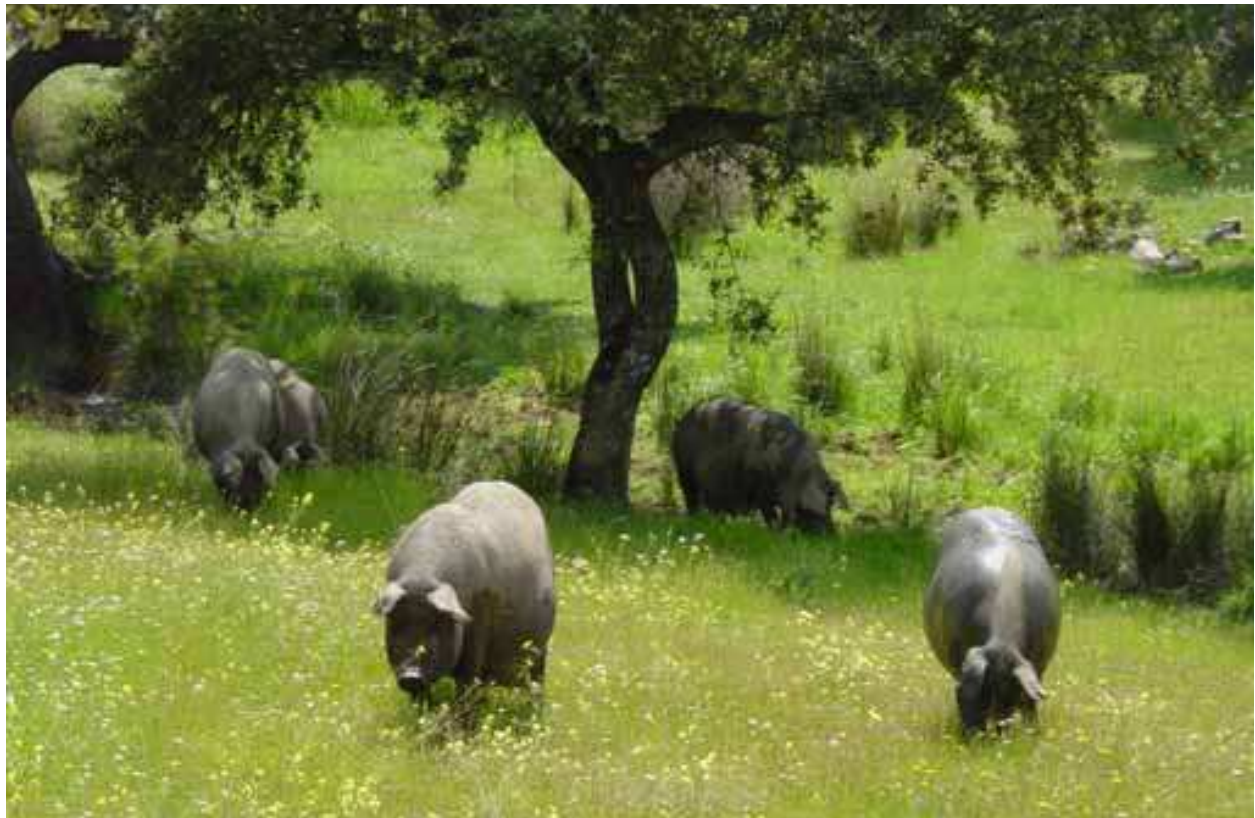
Fig. 5. Pregnant Iberian sows grazing in a dehesa during spring (Turcañada S.L., Casa Grande, Fuente Obejuna, Córdoba, Spain).

that the meadow is a paradigm of balance and interdependence between production and nature conservation, where its high environmental values are a result of its extensive management, balanced and efficient, which can be considered a powerful conservation tool.