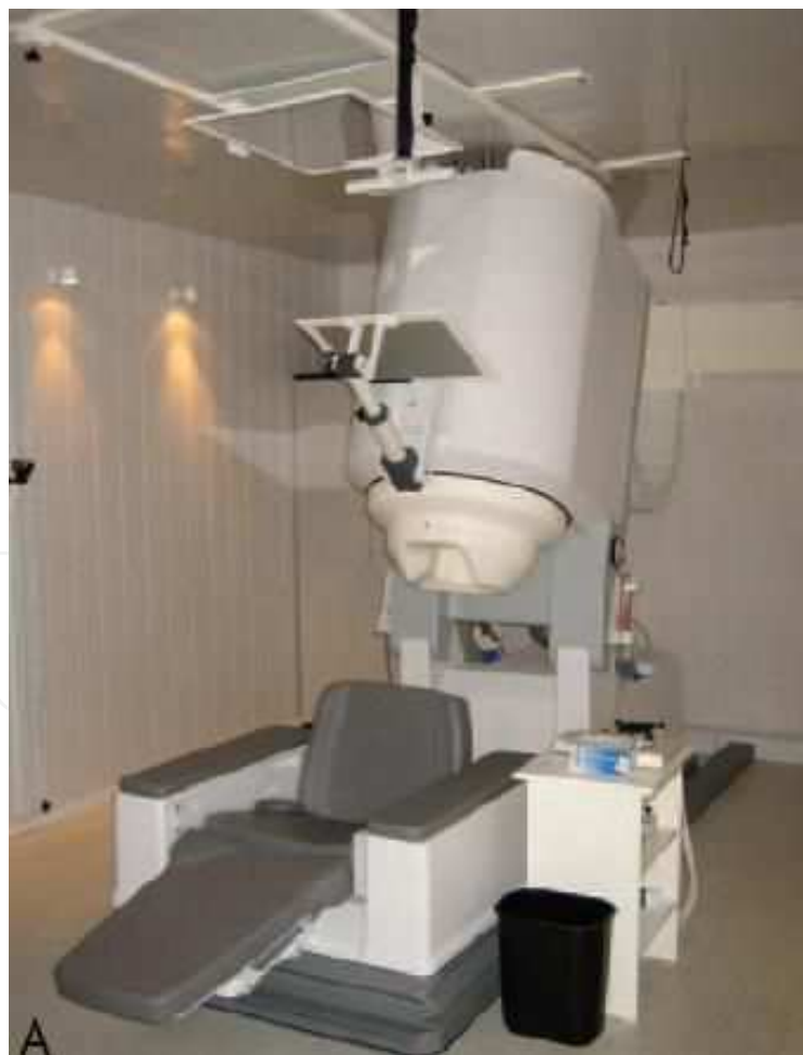
Fig. 1. A, Biomagnetometer in a electrically shielded room. Patients can be comfortably studied in a seated or supine position.

Once of the aspects in which MEG can more quickly define its contributions are without and doubt its application to presurgical study of patients with epilepsy resisted to medical treatment (Shibasaki,et al., 2007).