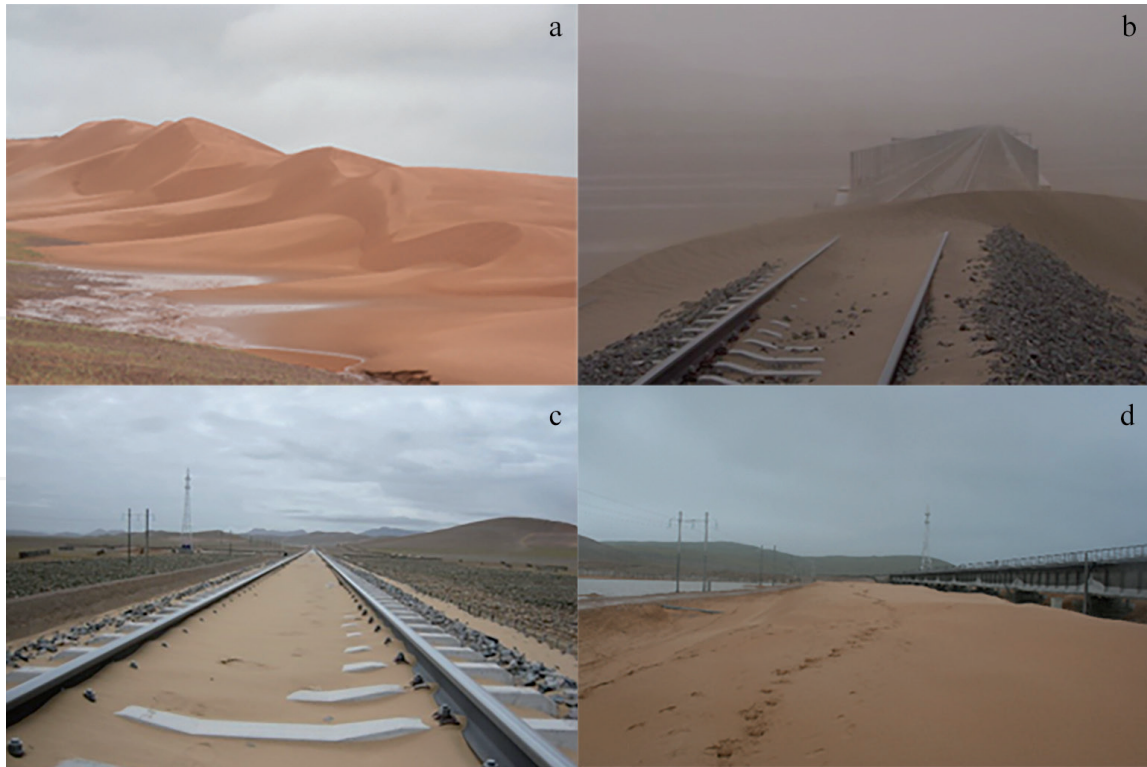
Figure 1. Sand disasters along the Qinghai-Tibet Railway. (a) Hongliang River section, (b) Tuotuo River section, (c) Za'gya Zangbo section, (d) Cuona Lake section.

and other areas, the number of strong wind days is more than 100 days. Moreover, the climate is relatively dry in winter and spring. For example, in the Tuotuo River area, according to the observation data of the weather station for many years, the average annual wind speed is greater than 4 \text{ m s}^{-1} . The number of windy days is more than 140 days. The number of sandstorm days in the year is 15–22 days. The annual precipitation is about 200 mm, mainly from June to September (about 85%). There is no snow cover in winter and spring, and the surface is extremely dry. At the same time, this period is also a period of high winds, with the highest wind speed reaching 32 \text{ m s}^{-1} . Therefore, the Qinghai-Tibet Railway sand disaster occurred in these seasons.