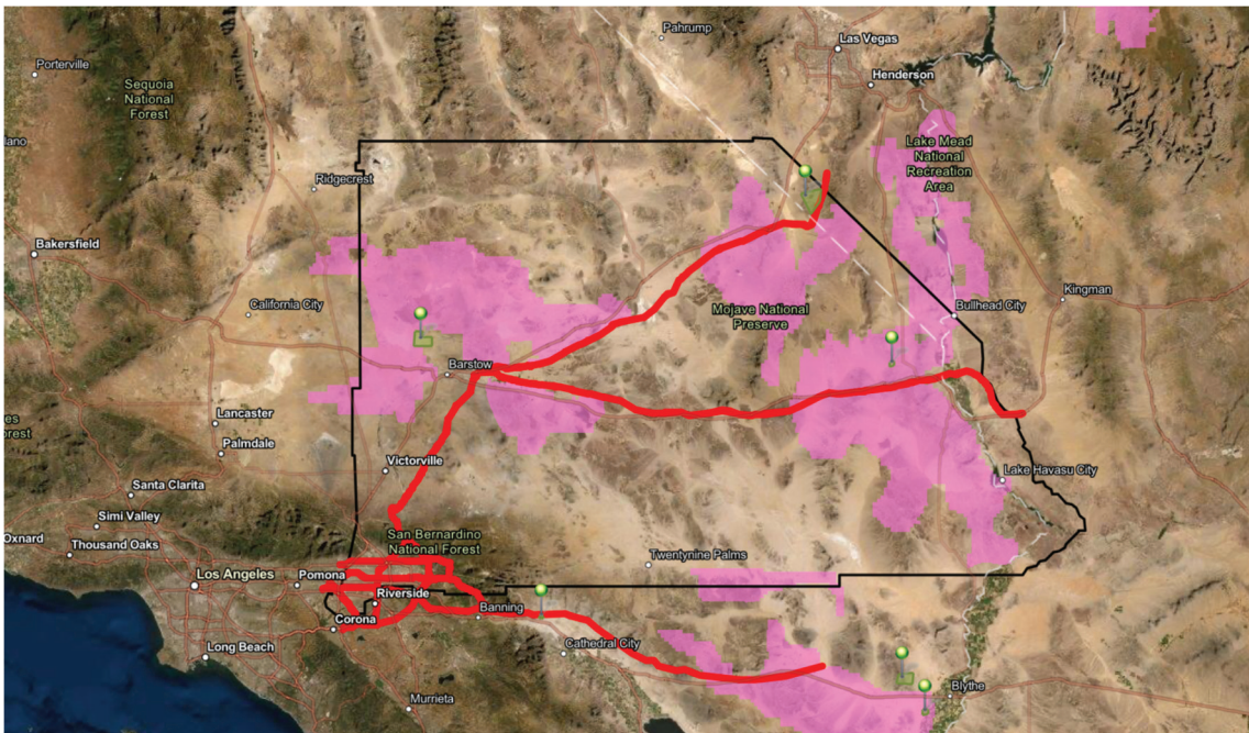
Figure 2. Solar installations (green points) and highways (red) in relation to desert tortoise habitats (pink).