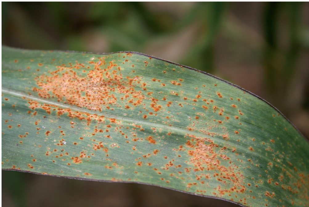
Figure 2. Polysora rust.

of the world, and it is observed in recent past from the peninsular India (coastal districts of Andhra Pradesh during winter and in Karnataka and Tamil Nadu during rainy season) on certain maize cultivars in Mysore district recorded in 1991 by [30]. The incidence of P. polysora has taken a heavy toll in majority of cultivars grown in Karnataka namely Mysore, Mandya, Hassan, Kolar, part of Coorg, Shimoga and Chitradurga district [31]. Disease is favored by wet/humid weather condition for infection and disease development at 12–27°C [32, 33]. Rain drizzle or even heavy dews allow spread of disease [34]. The maximum cardinal temperature for preceding infection period of P. polysora was estimated at 42°C and