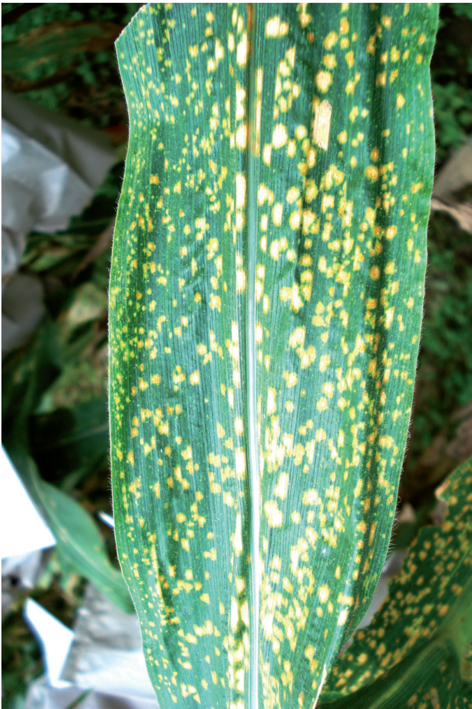
Figure 4. CLS.