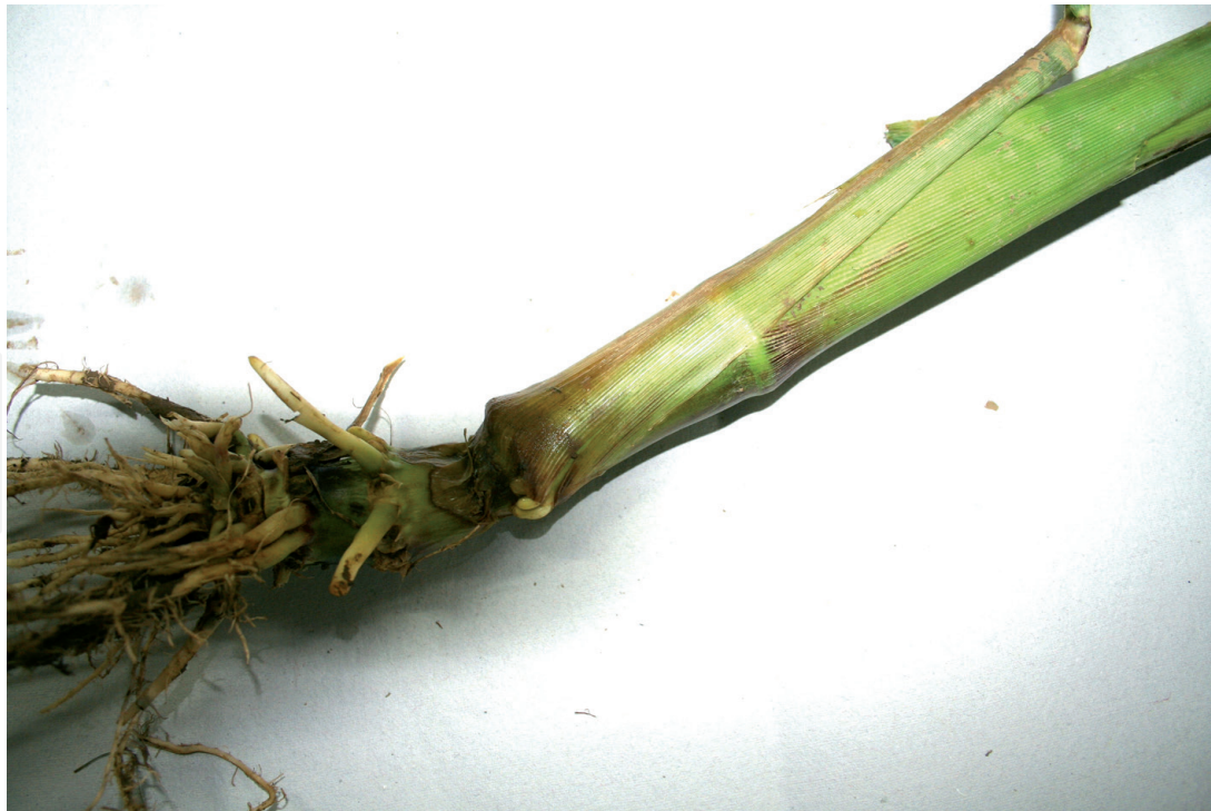
Figure 6. Pythium stalk rot.

which in general include coincidence of pathogen lifecycle events with host plant stages and/or natural antagonists/synergists. Therefore regional precipitation and distribution patterns led to unfavorable condition for development of sporulation for secondary infection. However, projected warmer and drier summers may hinder most fungal diseases, and finally slow down or completely inhibit disease progress of other foliar diseases. As a result the regional distribution patterns of this diseases may be modified and stated to infect rabi /winter maize due warming effect.