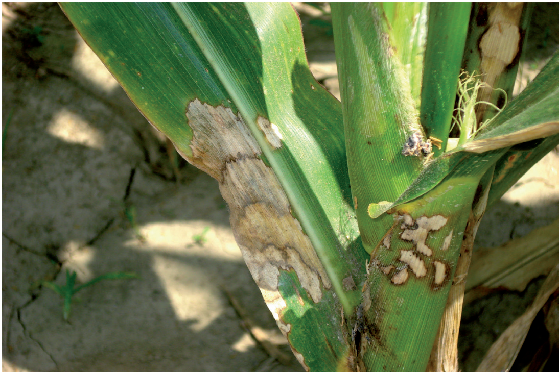
Figure 1. Banded leaf and sheath blight.