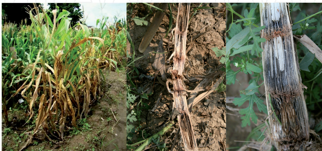
Figure 3. Field view and symptoms of PFSR.

This is a foliar disease and caused by Curvularia lunata , ( Figure 4 ) also common in many plant species in tropical, subtropical as well as sometimes in temperate regions. Earlier in 2000, in Indian subcontinent this disease observed in traces from most of the places. Now a days this disease ( Figure 5 ) recorded in severe condition from some pockets of Rajasthan from Uttarakhand (Haridwar, Dehradun and Kashipur). Polysora rust and Curvularia leaf spot (CLS) are emerging as a potential threat in Karnataka & Rajasthan respectively. Hot and humid climate favor the development of disease during flowering to grain filling stage.