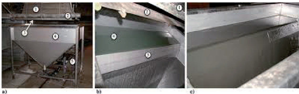
Figure 1. Example of a delivery system to irradiate sludge with high energy electrons. Photo (a) shows the entire system including the scanner of the accelerator (1), the air blower (2) to refrigerate the titanium window (3), the sludge delivery and collection tank (4), and the piping system to introduce the sludge in the tank from the bottom (5). The photo in (b) shows the scanner of the electron accelerator (1), the accelerator shutter (2), the weir with the irradiated sludge, simulated with water (3), and the incoming sludge (4). Photo in (c) shows an actual “curtain” of sludge flowing through the system.