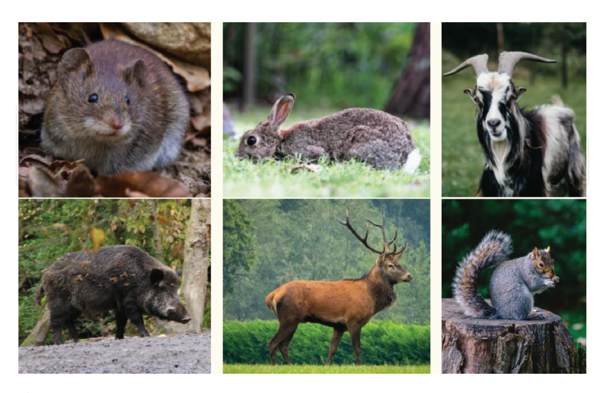
Figure 3. Invasive alien mammals: top right: mouse (Mus muscullus) native to south Asia is invasive worldwide; top centre: rabbit (Oryctolagus cuniculus) native to Europe; top right: feral goat (Capra hircus); bottom left: wild boar (Sus scrofa) native to Eurasia and Africa; bottom centre: red deer (Cervus elaphus) native to Europe; bottom right: grey-squirrel (Sciurus carolinensis) native to America.

With human settlement on oceanic islands new species were introduced as farm stock, crops, for fibres or furs, domestic animals, pets, sports, or solely as ornamentals [22, 23]. Other species, however, were introduced due to military operations, international trade, and globalisation, either ship cargoes, ballast water, shipwrecks, which unintentionally transported these exotic species to the island, whether plants or animals ( Figure 3 ) [24]. More recent invasions drivers are climate change, land-use change providing new habits, pollution, and the positive interaction among non-native species, a process known as invasion meltdown [25, 26].