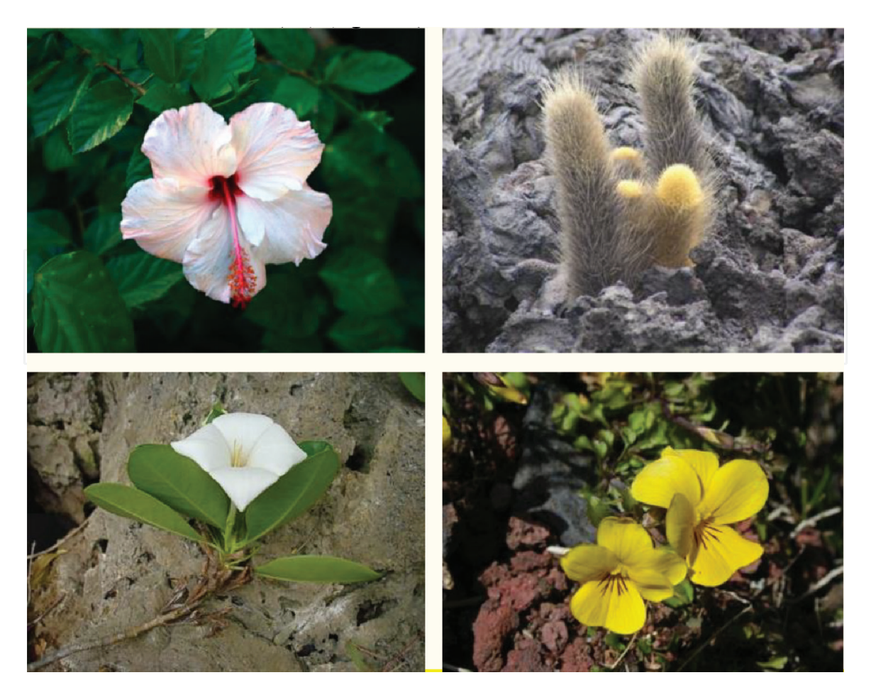
Figure 2. Endemic plant species from oceanic islands. Top left: Hibiscus arnottianus, from Hawaii; top right: Brachycereus nesioticus from Galapagos; bottom left: Bikkia tetrandra from Mariana; bottom right: Viola paradoxa from Madeira.

comprising the Solomon islands, Vanuatu and Papua New Guinea, include around 8,000 plant species of which about 3,000 are endemic, the Atlantic islands of Macaronesia are the third richest hotspot in the world in terms of its plant biodiversity (25,000 species); 5,330 species of native vascular plants are native to Polynesia-Micronesia, of which more than 3,070 are endemic, Japan has more than 5,600 plant species of which roughly a third are endemic [17]. Hawaii archipelago also has about 1180 native vascular plants, of which 1000 are angiosperms. Of these, about 900 are endemic ( Figure 2 ) [18].