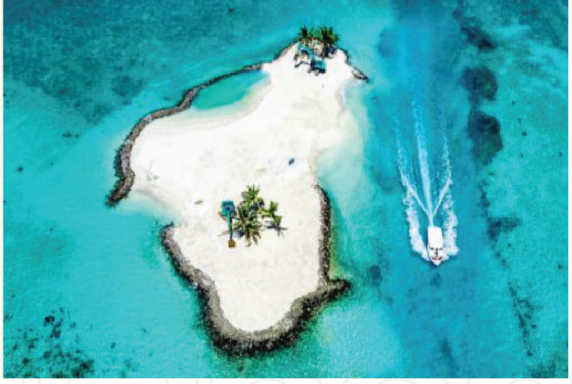
Figure 1. Examples of oceanic islands: left: S. Miguel, one of the nine islands of the Azores volcanic archipelago; right: an atoll at the Maldives, one of the 1192 coral islands that are grouped in 26 atolls.

are much smaller, being New Britain (Papua New Guinea), Grande Terre (New Caledonia), Negros (Philippines), and Hawaii (USA), the other large oceanic islands.