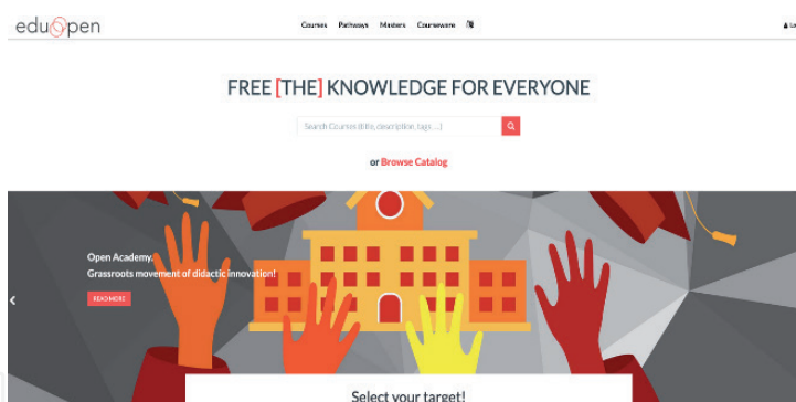
Figure 1. EduOpen platform.

However, it must be highlighted that, while indicated as a resource capable of increasing access to quality education [29], certain aspects of MOOCs have been criticised, especially the difficulties associated with assessment based predominantly on multiple-choice questionnaires [30, 31], poor interaction with participants [32, 33], failure to meet instructional design criteria [30, 34] and use of technology that is not accessible or user-friendly [30].