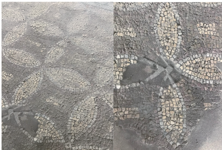
Figure 5. Different images of the artifact.

the restriction of access on the surface of the mosaic, scanning by terrestrial means is not possible in this case. In Figure 5 , it can be seen two shots taken manually at the arbitrary angle but also the effect of non-uniform environmental lighting.