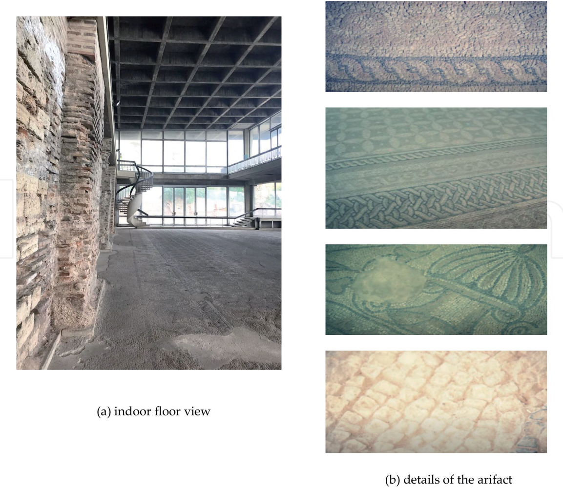
Figure 4. Ancient mosaic art in Constanta. (a) Indoor floor view. (b) Details of the artifact.