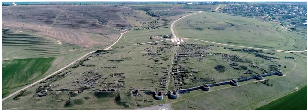
Figure 3. The Adamclisi Fortress ruins in Dobrogea, Romania.