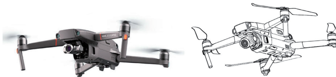
Figure 1. Professional drone Mavic 2 Enterprise with native surveillance camera mounted in front of the gimbal joint.