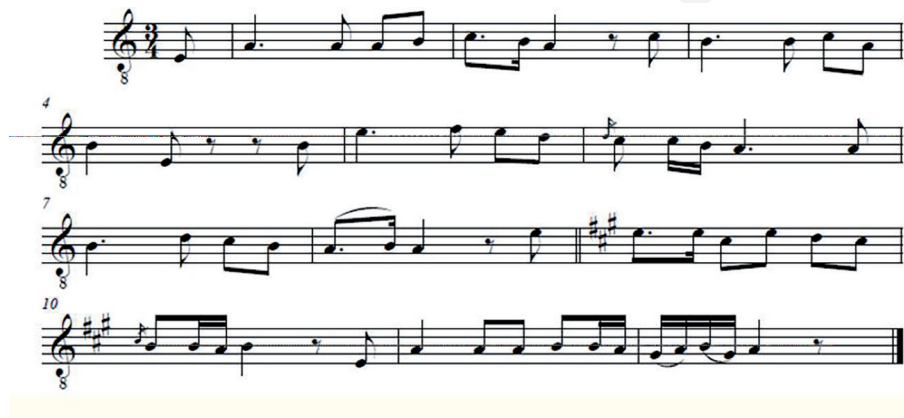
Figure 2. Sight-reading task.