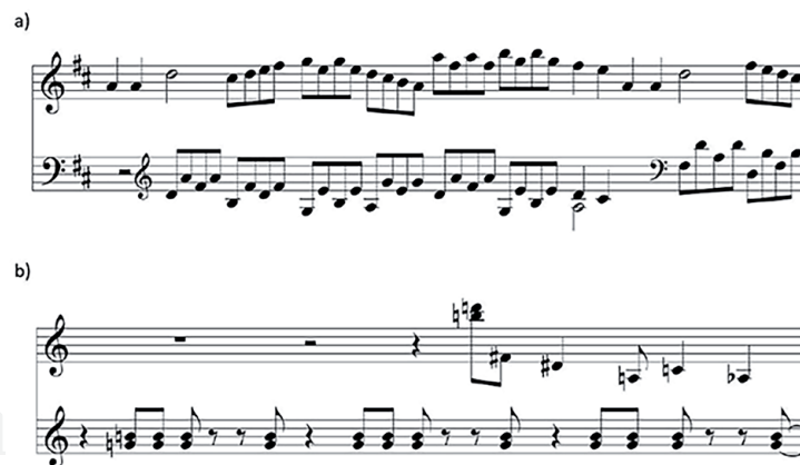
Figure 1. Excerpts of (a) Mozart and (b) Schönberg scores from the articulation task.

It should be noted that at the PUCV Music Institute, music theory and reading classes are taught using the Kodály method. This method is based on a note-phoneme conversion system. The principle starts from the basic structures of the scales in which, regardless of the initial pitch, the tone and semitone relationships are maintained. Thus, for example, the C major scale shares the same number of notes, and the same relationships between them, as the D major scale. Therefore, a student who was