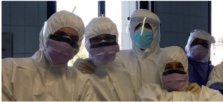
Figure 2. Preparation to a Covid burned patient surgery with all protective disposable.

patient should be wearing appropriate PPE. All non-necessary material must remain outside the OR including medical records which may be consulted either by doffing or by personnel non involved in the OR and then communicated inside the OR.