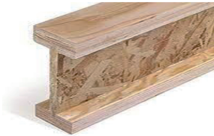
Figure 8. Wood I beam [75].

economy. Nowadays, wood based I beams are becoming popular. Beams allow easy execution of installation penetration. Their 'I' configuration provides high strength and stiffness.