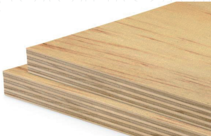
Figure 6. Structural plywood [64].

Wood I beam are engineered wood products which have great strength in respect to its size and weight. Wood I beam is a light beam support assembled by gluing together wooden flanges and fiber board and plywood beams. The flanges of beam made of laminated veneer lumber or finger jointed solid wood lumber. The web of beam made of plywood, laminated veneer lumber or oriented strand board. Wood I beam are available up to 80 feet long ( Figure 8 ). It has been used in residential and commercial construction as floor, roof structure of structure and external wall frames. I beam are best for the structure which required rigidity, heat insulation and