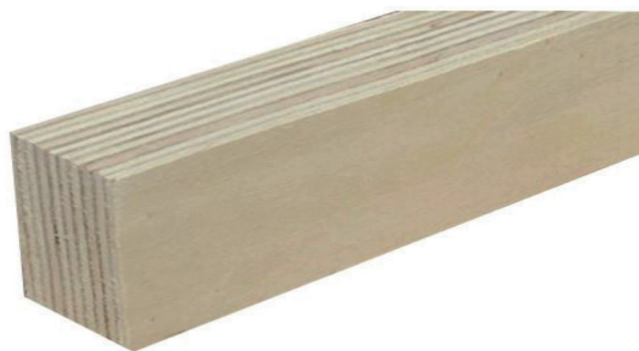
Figure 3. Laminated veneer lumber [54].

LSL is usually realized Timber strand. As of now, LSL is being made from excess, over develop aspen trees that normally are not huge, solid, or sufficiently straight to develop conventionally wood products. In this cycle, the debarked logs are utilized to give the material to chipped strands, which can be up to 300 mm long. These strands are then dried, coated with adhesive, and pressed into huge billets by a process which incorporates steam injection ( Figure 4 ). The billet might be up to 140 mm thick, 2.4 m wide and 10metres long. Subsequent to sanding, countless sizes are sliced to suit applications like headers, edge joists for floor frameworks,