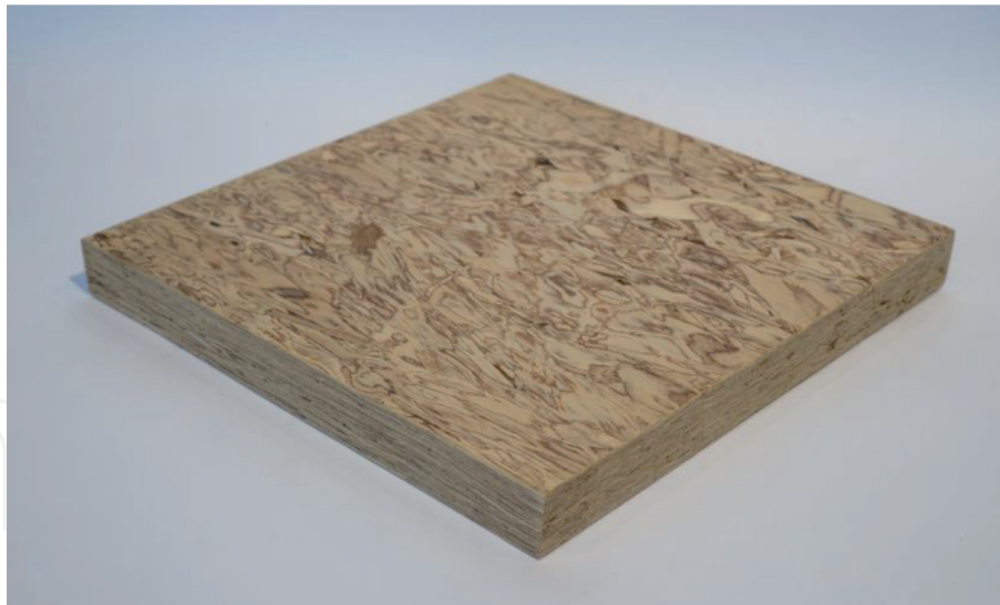
Figure 4. Laminated Strand lumber [56].

columns, joists and studs. It is utilized for a wide scope of millwork, like doors, windows, and practically any item that require high grade lumber. It is additionally utilized for truck decks, fabricated housing, and some structural lumber such as window and door headers [57, 58].