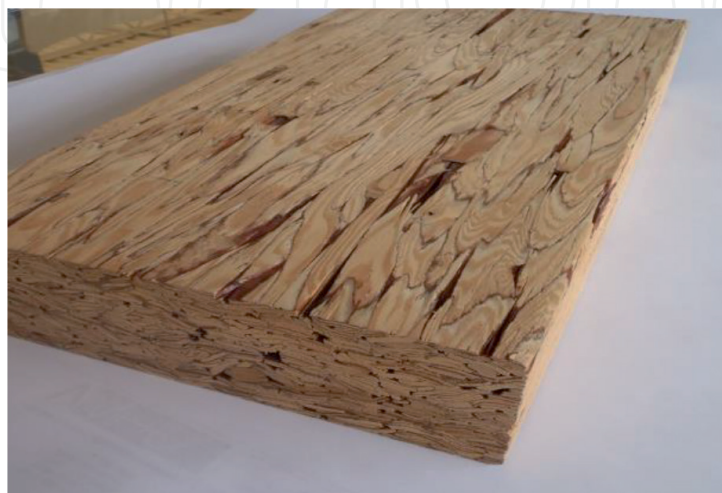
Figure 5. Parallel Strand lumber [60].

PSL, ordinarily known Parallam, is intended to supplant huge dimension lumber (beams, planks, and posts). Parallel strand lumber was developed in Canada, advanced onto the market in the last part of the 1980's [59]. PSL comes in numerous thicknesses and widths and is fabricated up to 66 feet in length ( Figure 5 ). The strands are for the most part taken from veneers peeled from the outermost part of the logs, where more grain is found. Veneers are dried to 11% moisture content and reviewed for strength prior to chopping into strands [61]. They are then adjusted parallel to each other, coated with waterproof glue, then pressed and cured [62, 63]. It is utilized for enormous individuals in residential construction and as middle and huge individuals in commercial building construction.