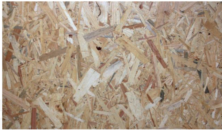
Figure 7. Oriented Strand board [71].