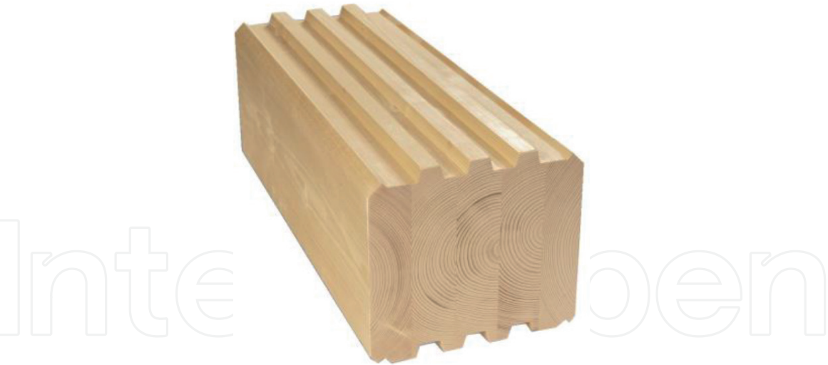
Figure 1. Glulam [35].

cross-sectional zones, lamination boards are regularly joined at the ends to develop glulam individuals that increased the lengths of stock lumber. Recently, fiber-reinforced polymers have been included in the manufacture of some glulam production [36]. This component enhances the tensile performance of the member and is said to offer economic benefit in some applications [37–42]. Glulam is often used as straight beams, including lintels, purlins, ridge beams and floor beams, Columns including round, square and complex section, curved beams and roofs.