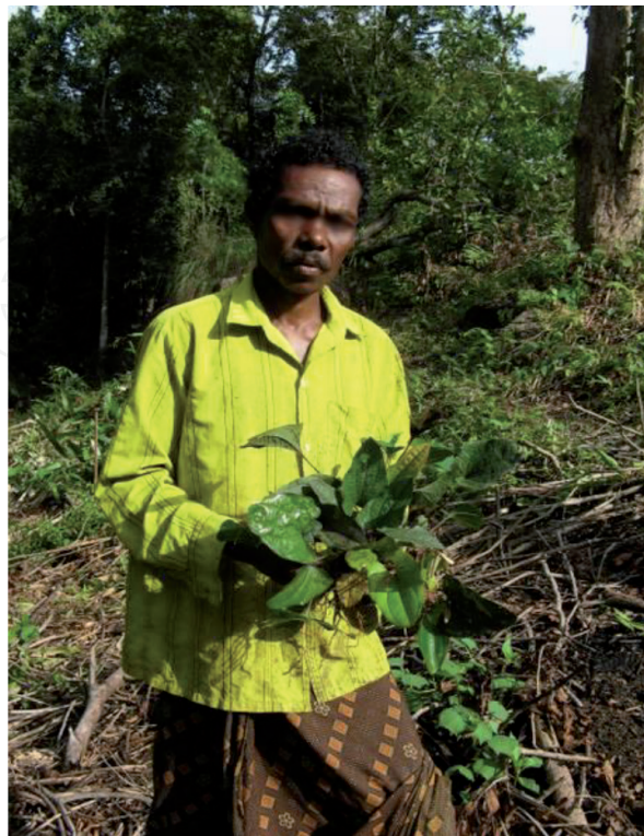
Figure 2. Kani tribe with Trichopus zeylanicus collected from southern Western Ghats Kerala.

The emergence of the discourse of 'Bioprospecting' was discussed in (in the late 1980s or early 1990s) for the search of biological resources that can help to contribute for the conservation as well as the discovery of beneficial products [42]. Bioprospecting is defined as 'the search for biodiversity, for valuable genetic and biochemical information found in wild animals, plants or microbial organisms' for product development as a purely scientific and commercial endeavor [43]. Bioprospecting is the exploration of biodiversity for new biological resources of social and economic value. It is carried out by a wide variety of industries, the best known being the pharmaceutical industry, but also by a variety of branches of agriculture, manufacturing, engineering, construction and many others [44]. The bioprospecting concept is based on recognition of the importance of natural product discovery for the development of new crops and medicines, often based on traditional knowledge [42]. Pharmaceutical bioprospecting has been sharply criticized for what has become known as 'biopiracy' in which large international pharmaceutical corporations make use of local medicinal knowledge without acknowledging that it is indigenous intellectual property [44, 45].