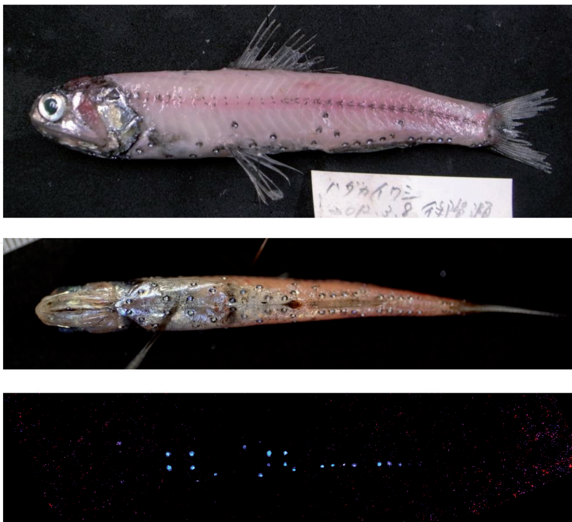
Figure 2. Photographs of Diaphus sp. captured from a lateral (upper) and ventral view (middle). Displaying the photophores that produce a blue luminescent light (lower).

Support for a dietary origin for luciferin in a number of stomiids is supported by their ability to uptake other small molecules to utilise in light emission. An example of this is shown in several species of loose-jaw dragonfish ( Malacosteus spp.), that have a rare ability to emit longer wavelengths of luminescence that is red in colour, as opposed to blue light which is more ubiquitous in the oceans [1]. Malacosteus can also detect red wavelengths of light using a distinct mechanism requiring derivatives of bacteriochlorophylls c and d that enhance its sensitivity to these longer wavelengths [66]. As vertebrates are unable to synthesise chlorophyll, Malacosteus could obtain this through a diet, predominantly of grazers such as copepods that will contain phytoplankton derived pigments in their guts [64]. This strongly supports the concept that other small organic compounds such as luciferins can be taken up by dragonfishes, as well as other Stomiiformes to utilise in their bioluminescent reactions.