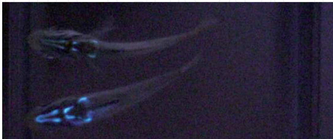
Figure 4. Ventral view of Parapriacanthus ransonneti taken in a dark room to capture the light emission from these body regions.

This example of a “kleptoprotein” form of luminescence where both the substrate and the enzyme are provided through the diet, provides an additional novel category of luminescent reactions, as of yet not considered. Moreover, this highlights the possibility that other luminescent species may utilise this capability to obtain active exogenous luciferase from their gut. Potentially, this may include several species of fishes that predate on ostracods, whose light organs are often connected to their digestive tracts. This research may suggest that semi-intrinsic and “kleptoprotein” luminescent behaviours may be more widespread than previously considered, with proteins associated with other biological processes potentially being able to be attained via diet as opposed to gene expression.