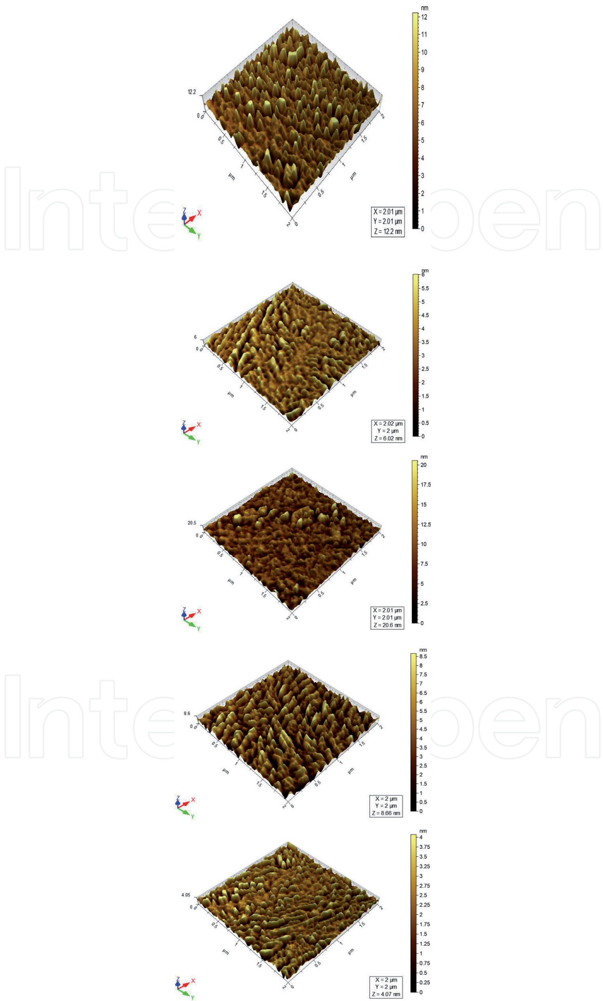
Figure 2. 3D surface structures for sample V, VI, VII, VIII, and X respectively.