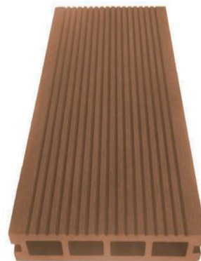
Figure 1. Fencing and deck board made from WPCs.