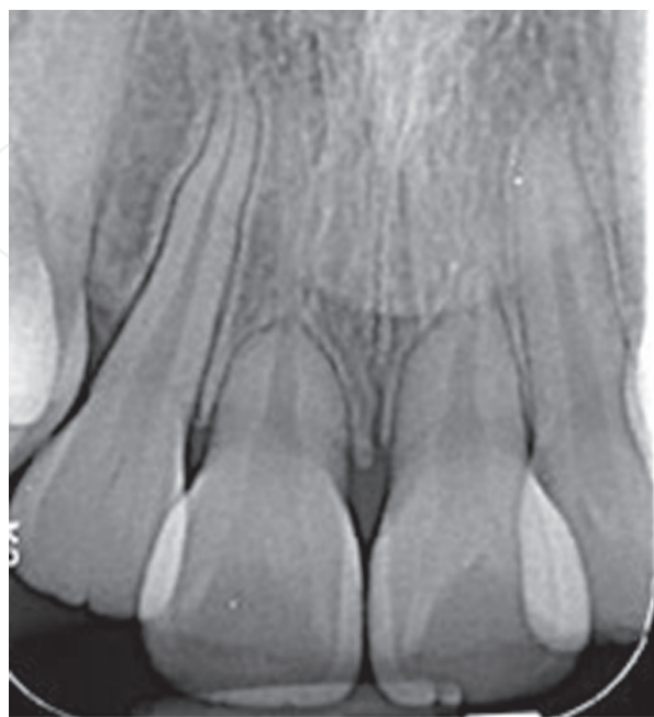
Figure 1. Periapical radiograph showing an example of maxillary incisors in a Hispanic female subject with localized SRA before starting orthodontic treatment.

Some studies have found that patients with short or blunted roots prior to treatment, undergo significantly more root shortening during orthodontic treatment than patients with no dental anomaly [12–14], while others have found a minor or non-significant relationship between blunted roots and root resorption with orthodontic treatment [2, 15, 16] and still others report that blunted teeth experience less resorption than normal-shaped teeth [11].