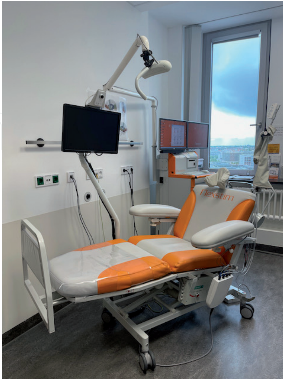
Figure 1. TMS hardware.

sulcus is recommended (please see [12] for more information on how to perform an nTMS session) ( Figure 2 ).