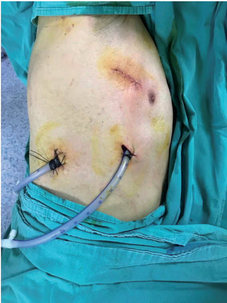
Figure 4. Incisions in the 3-port VATS technique.

Although there are different variations in this technique in terms of the placement of the camera port, in our clinic, we prefer the middle or anterior axillary