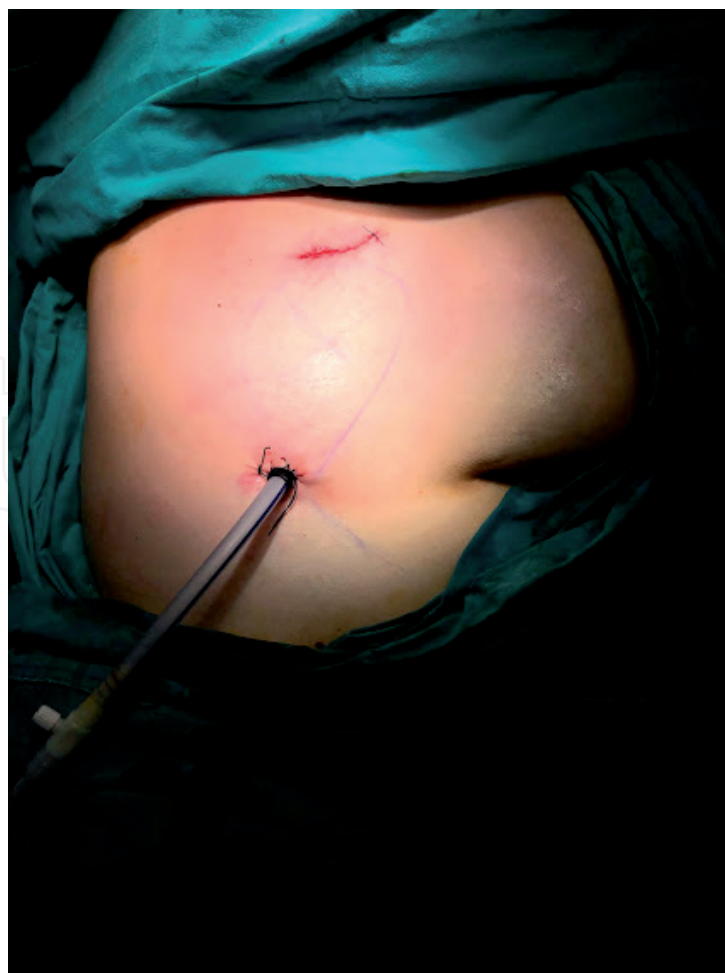
Figure 5. Incisions in the 2-port VATS technique.

The first uniportal VATS lobectomy was reported by Gonzalez-Rivas in 2011. In the following years, Gonzales demonstrated that even the most complex lung resections can be performed with uniportal VATS successfully and safely. Uniportal VATS has become preferred by many surgeons due to its advantages, such as causing less tissue damage and providing direct vision [18, 19].