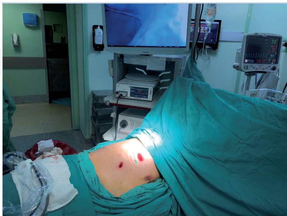
Figure 3. Patient and camera position during VATS.

The patient is positioned in full lateral decubitus position with slight flexion of the table at the level of the mid-chest, which allows slight splaying of the ribs to