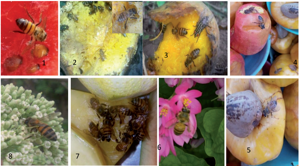
Figure 1. Honey bee foraging for nectar and/or pollen: 1: Citrullus lanatus (Thunb.) Matsum. & Nakal (water melon) fruit, 2–3: Mangifera indica (mango) fruit, 4–5: Anacardium occidentale L. (cashew) fruit. 7: Antigonon leptopus Hook. & Arn. (Mexican creeper) flower, 7: Ananas comosus (L.) Merr. (pineapple) fruit, 8: Canthium danlapii flower.

Apiculture is the aspect of agriculture that covers this part of biological sciences. Melissopalynology thus deals the representation of pollen types (that is flowering plants visited by honeybees) in honeys collected and marketed for humans. Depending on the rate of foraging and seasonality of flowering in honeybees plants, honeybee farmers can collect or extract honey from honeycombs or artificially manufactured hives on a weekly or monthly basis. The taste, colour, texture and fragrance of the honey are dependent on the type of flora visited. If the honey is derived from a single flora, it is called unifloral and if it is from several floras, it is referred to as multifloral or polyfloral honey. In understanding flora dynamics, mulitfloral honeys