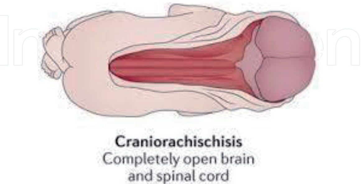
Figure 1. Diagram of Craniorachischisis.

It is a rare severe defect of the occipital bone, with cervical spina bifida and retroflexion of the head on the cervical spine. An occipital encephalocele may be present. Like anencephaly, there is a strong female preponderance ( Figure 2 ).