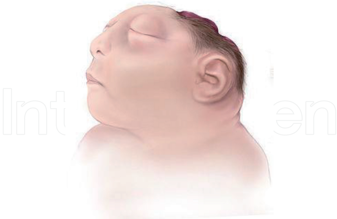
Figure 3. Diagram showing anencephaly.