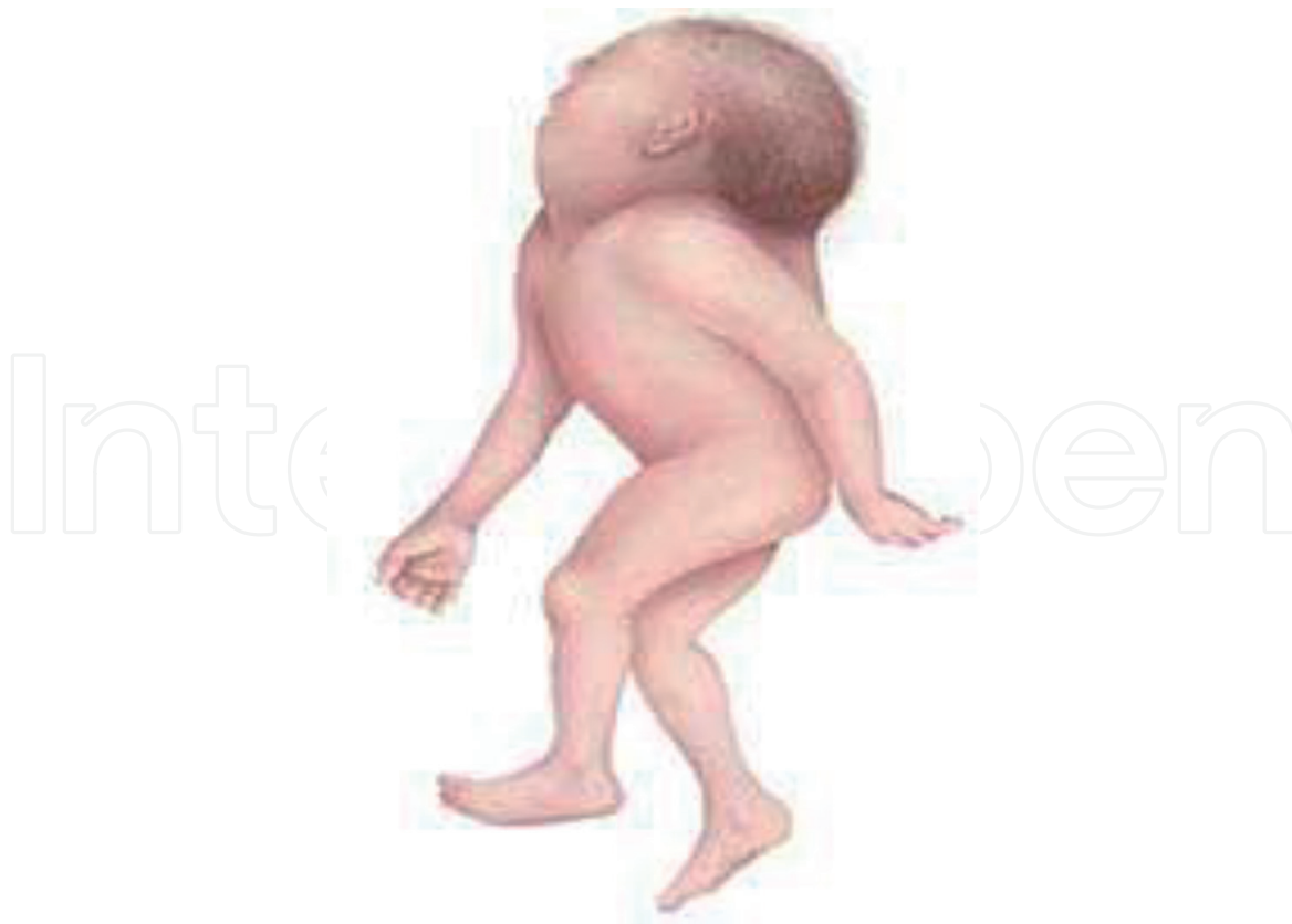
Figure 2. Diagram of iniencephaly.