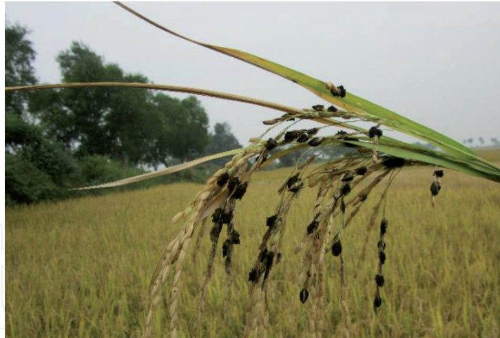
Figure 1. Rice panicle infected with false smut.

The chlamydospores survive the winter in the soil and act as primary source of infection in the succeeding rice plants. Therefore, the pathogen is primarily soil and air-borne. The pathogen is a slow-growing fungus that forms abundant conidia in cultures which are globose in shape and echinulated under scanning electron microscope [7, 8]. False smut of rice can be managed using appropriate fungicides, cultural practices, bio-agents, plant extracts, resistant cultivar and integrated disease management techniques which are briefly discussed.