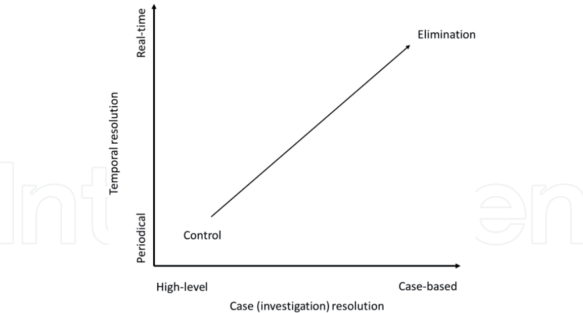
Figure 1. Changes in surveillance system requirements along transmission continuum (adapted from [9]).

successfully integrate data from the private sector into the national surveillance system [14]. To achieve this, there is an increasing need to establish digital data collection to ensure rapid and complete case reporting from all health system levels, including the private sector [9, 15]. Many countries have developed digitalized reporting systems. One example is Mozambique, a country with high transmission heterogeneity, where, since 2016, community health workers are equipped with smartphones carrying an app through which they can report every patient consultation – including malaria cases. This facilitates the notification of community cases to higher administrative levels that carry out case investigations [16].