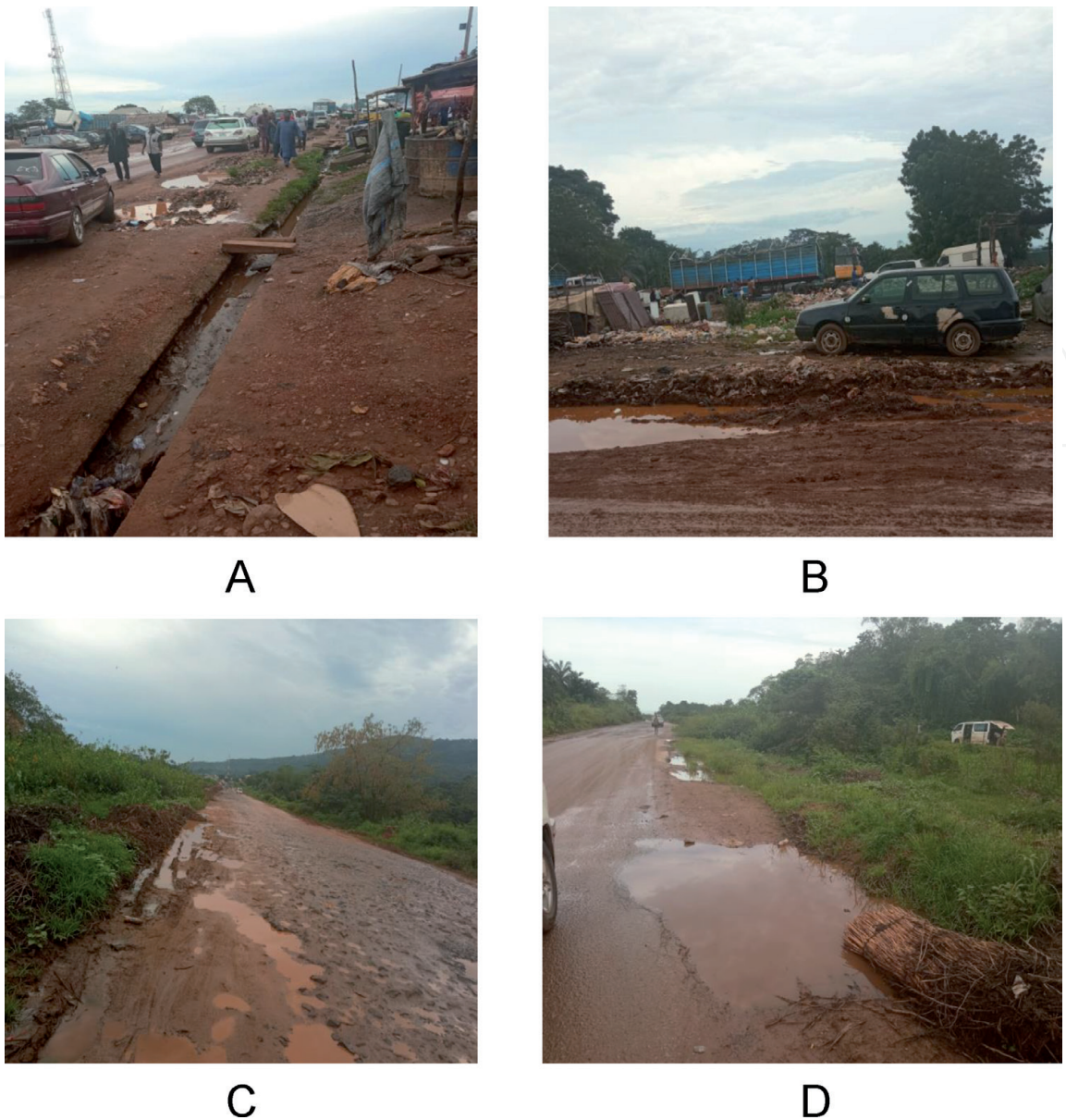
Figure 3. A section of Enugu – Port-Harcourt Express Road, Lokpanta, Imo State. This section of the road reveal typical South Eastern Nigerian road that is supposed to be maintained by the Federal Government headed by President Mohammed Buhari. The failure of government to be functional created the observed collection of water, blocked drain, mud, solid wastes, grass, stuck vehicles, used tyres and squalid environment all of which provide perfect environment for mosquito breeding and optimized malaria transmission (A–D).

may not be different in man. Thus our leaders’ have been modified to behave like parasites. And in our case, the bad policies of our leaders in governments ultimately assist parasites like P. falciparum to thrive.