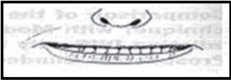
Class I Lower incisors can bite the upper lip above Vermilion line.

The Mallampati Classification is extremely useful in detection of potential obstructive sleep apnea as well as predictions of difficult endotracheal intubation,