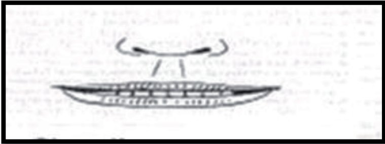
Class II Lower incisors can bite the upper lip below Vermilion line.