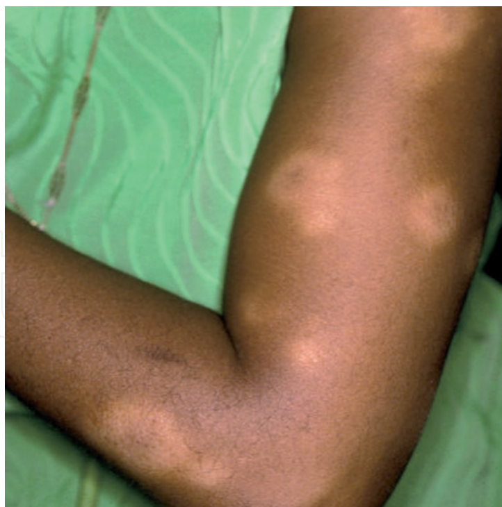
Figure 6. Cutaneous sarcoidosis; clinical variants, the hypopigmented variant is more noticeable in individuals with a darkly-pigmented skin.

contraindicated. Hypopigmented cutaneous sarcoidosis is responsive to minocycline [11] and can be treated with 8-methoxypsoralen [12] and long-wave ultraviolet light.