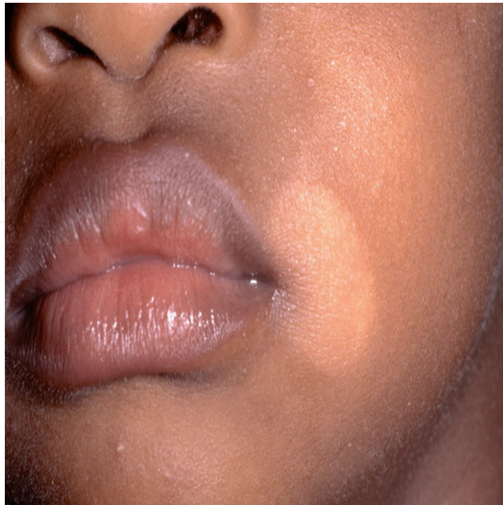
Figure 2. Pityriasis alba: A common disfiguring hypomelanosis, which, as the name indicates, is a white area (alba) with very mild scaling (pityriasis). It is observed in a large number of children in the summer intemperate climates.

The eruptions usually appear as round or oval macules or patches with an indistinct border with or without slight and often asymptomatic scales ( Figure 2 ). The lesions normally become more visible in summer and may initially appear pink in