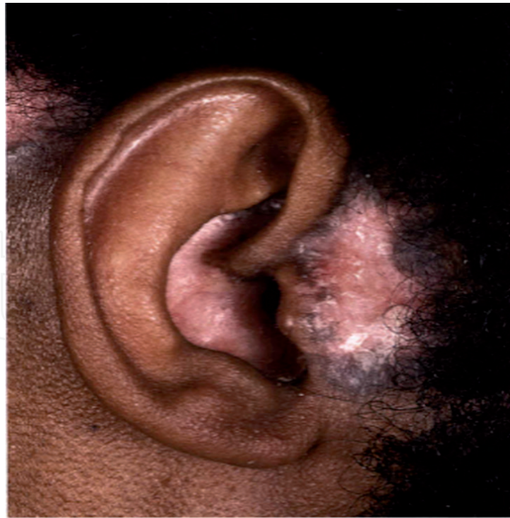
Figure 3. Discoid lupus erythematosus; there are well-defined, erythematous, scaling lesions with a pigmented margin and central depigmentation and behind the ear in this west Indian.