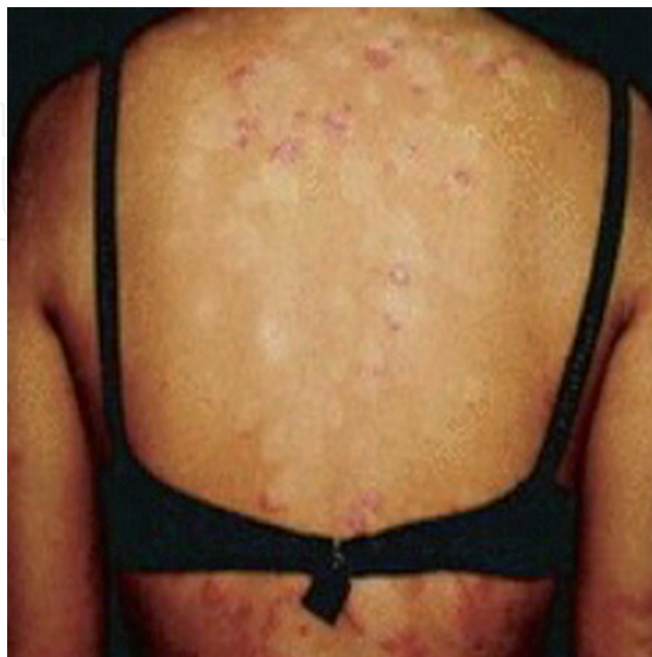
Figure 1. Psoriasis, showing multiple-well demarcated hypopigmented lesions.

UVB phototherapy and epidermal melanocyte transplantation can help treat completely-destroyed or depigmented melanocytes. Photo protection, apply broad spectrum (UVAUVB) SPF 30 or 50 and reapply every 2–4 hours self-tanner (dihydroxyacetone). Applying topical ironoxide (3%) can effectively protect the skin against blue visible light, especially in dark-skinned patients with PIH.