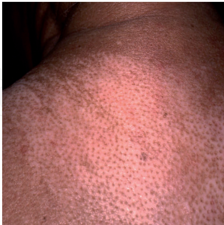
Figure 4. “Salt and pepper” sign Leukoderma with the retention of perifollicular pigmentation in a patient with systemic sclerosis.

Topical and intralesional steroids are recommended for the inflammatory stages. Topical tacrolimus, calcipotriol and imiquimod have been also used. Combination therapies used in the absence of responses include calcipotriol and betamethasone or imiquimod or low dose PUVA alone or with calcipotriol.