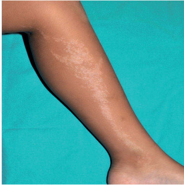
Figure 7. Lichen striatus: Linear streaks on the leg along the lines of Blaschko, comparing numerous small, flat-topped tan (hypopigmented) papules.