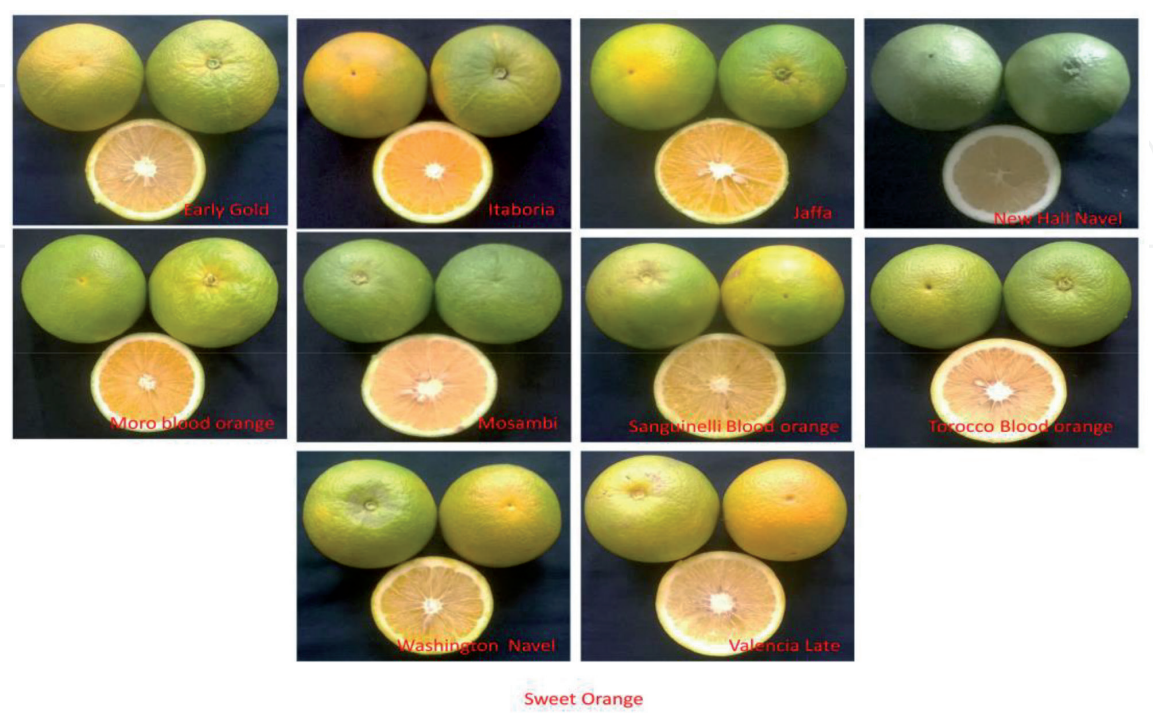
Figure 1. Sweet orange varieties.

Washington (Riverside, Bahia, Baia or Baiana): Is considered to be a limb sport of a variety ‘Selecta’ in Bahia, Brazil. Tree medium in size and vigor, crown round topped, anthers are without pollen. Rind medium thick tender flesh deep orange, firm less juicy, rich in flavor and taste. Processing quality poor, ships and stores well. Seedless.