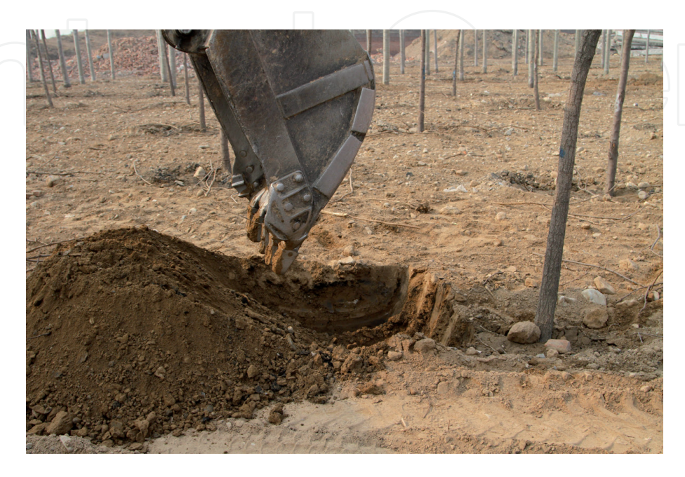
Figure 9. Use excavators to dig a hole for the afforestation.

Seeds and seedlings are sexual afforestation method, and many trees also have asexual reproduction ability. Cutting is a piece of a plant that can be used in