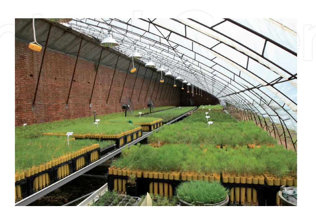
Figure 8. Container seedlings of Larix principis-rupprechtii in a greenhouse.

Compared with seeding afforestation, container seedlings show better environmental adaptability and stress resistance because of their protected root systems ( Figure 8 ). Container seedlings have increased survival rates of or more than other transplant types and show improved growth on adverse sites, though they cost more than bare-root seedlings [104]. Under droughty conditions, container seedlings survived and grew better than bare root seedlings [105]. Furthermore, some researchers mentioned no difference between bare root seedlings and container seedlings when soil moisture was adequate at the planting time [106].