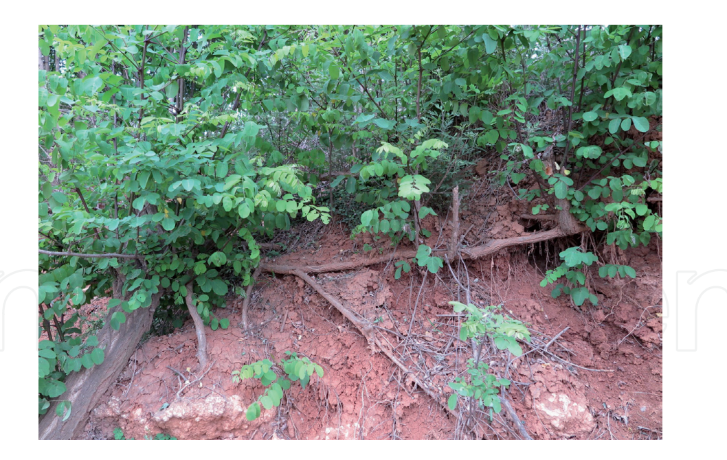
Figure 10. Root sprouting of black locust.

afforestation. It can be taken from stems, branches, leaves, roots and directly plant on forest land. Cuttings can maintain the parent tree's target characteristics, such as high yield, fast growth, and stress resistance ability [114, 115]. Some research showed that cuttings' behavior varies with age, genotypes, the parent plant's physiological status, cutting position, and temperature [116, 117]. Besides, sprouting is another afforestation method that can produce a new forest. Sprouts are more resistant to disturbance than seed-origin seedlings and grow fast [7, 118]. Compared with the plant with seed and seedling, cutting afforestation is labor-saving, time-saving, and low-cost.