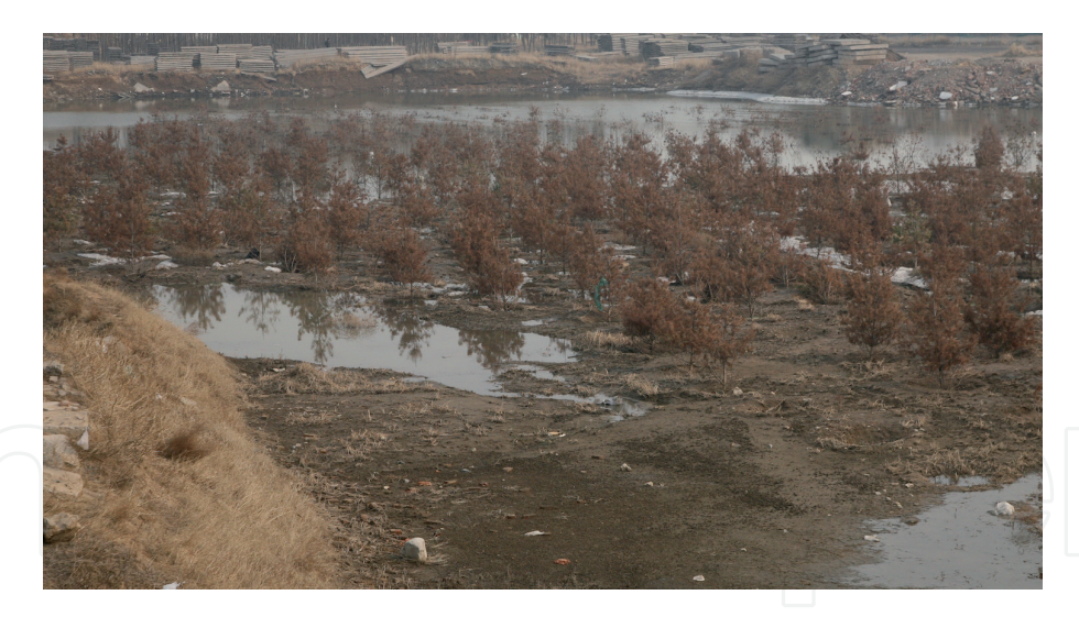
Figure 7. After a rain, the accumulation of water in afforestation land caused the death of seedlings.