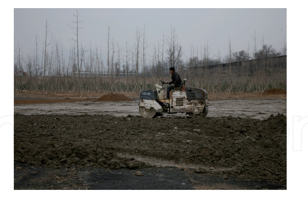
Figure 6. Use a tractor for site preparation.