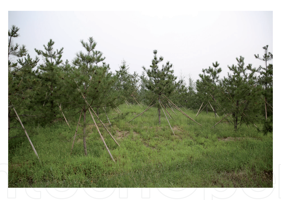
Figure 2. Pinus tabulaeformis forest in city plain area, Beijing.

Another critical factor affecting the success or failure of afforestation is the healthy growth of the root system. Whether it is a seed or a seedling, only rooting or rooting after transplanting can form a forest [4]. Site preparation promotes and ensures that the root system can be closely integrated with the soil through different methods. Furthermore, promote the root system to absorb enough water.