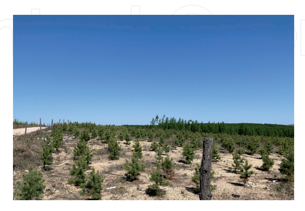
Figure 4. Reforestation site after clearcutting.

Many factors affect the forest site and tree growth; see 2.2.1, 2.2.2, and 2.2.3. However, some factors have little effect on the growth and development of trees, and some factors play a decisive role. These decisive factors are called dominant factors. Generally, the climate is the dominant factor at the regional scale, and landform and soil are the dominant factors at the management unit scale [39]. There are two methods to determine the dominant factors. One is to analyze the relationship between each environmental factor and the essential living factors (light, heat, air,