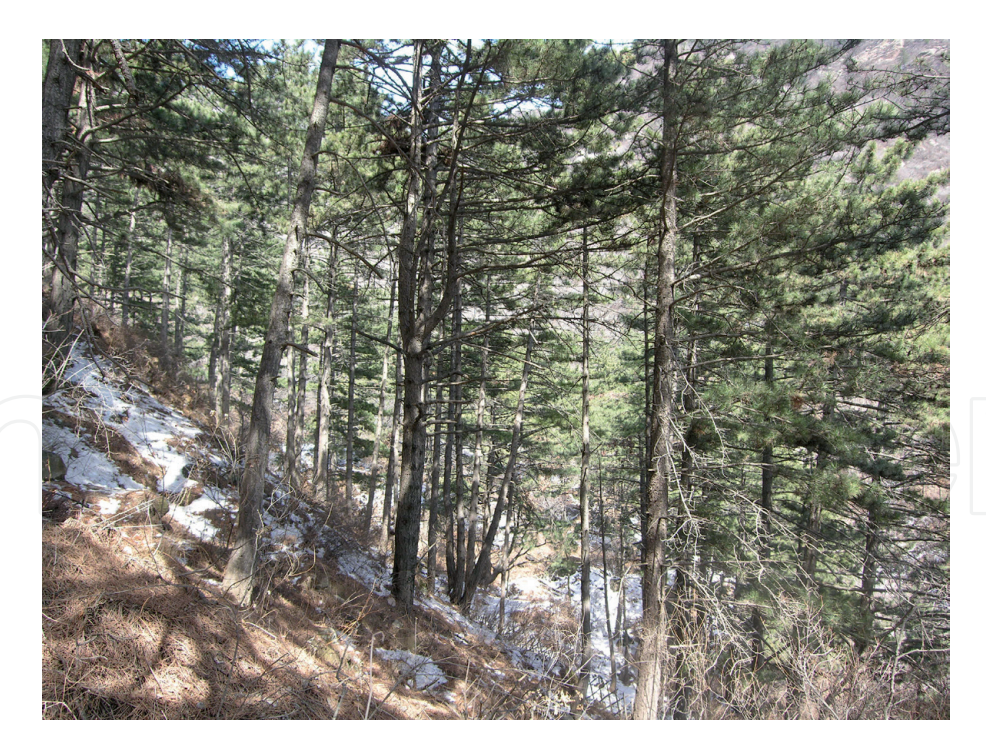
Figure 1. Pinus tabulaeformis forest in Song Mountain , Beijing .