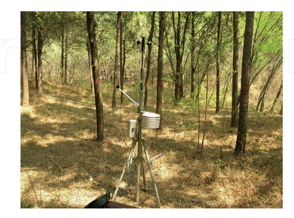
Figure 3. A weather station that can monitor a variety of climate factors.

At present, there are many monitoring instruments that can monitor forest meteorological factors, including radiation, temperature, humidity, wind speed, wind direction, etc. ( Figure 3 ). It provides an important data source for afforestation and future forest management.