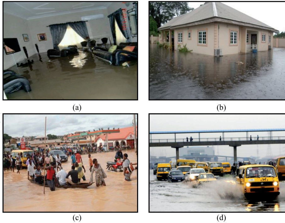
Figure 2. Examples of flooding scenes in the Lagos metropolis of Nigeria: (a) living room submerged by flood water, (b) residential building submerged, (c) local community affected by flood waters, and (d) expressway overwhelmed by flood water. Source: Online images of flooding in Lagos, Nigeria.