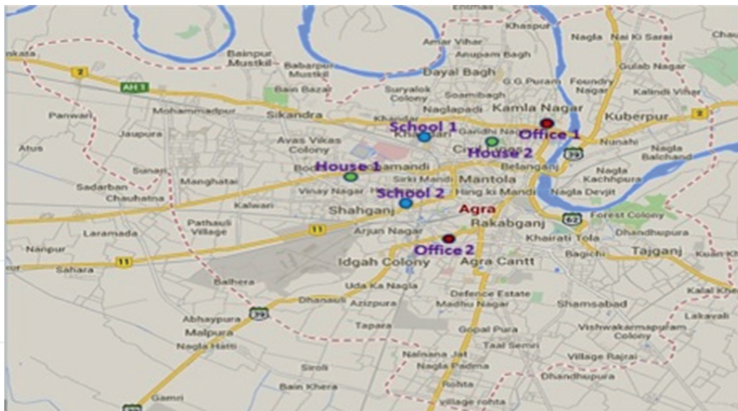
Figure 1. Site map of Agra showing major regions, roads, and highways and sampling sites. Two homes, two schools, two offices.

from 70–90%. The pre-monsoon and monsoon periods experience strong north-east and southeast winds and in the winter, the temperature varies from 5–25°C. Thunderstorms and dust storms are frequently observed during the months from March to June. The wind speeds diverge from 2.6 to 6.9 Km/h with a maximum during summer and monsoons and a minimum in winters [7]. Agra is the one of the most populated cities in Uttar Pradesh, India. Agra has a population of about 1.5 million (Females = 47% and Males = 53%), with a birth rate of 28/1000 people and a death rate of 7/1000 people (Agra Nagar [8]). Tones of solid wastes are generated every day that can be seen in the form of piles along roadsides and streets due to poor municipal services. It is also a major cause for adding contamination to soil and groundwater. In the present study, personal and ambient monitoring was carried out for PM 2.5 in three different locations (two homes, two schools, and two offices) in the city of Agra ( Figure 1 ).