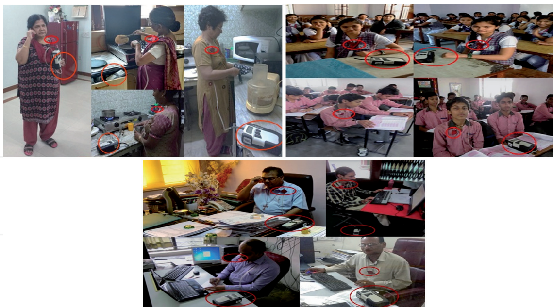
Figure 2. Sampling done at homes, schools and offices.