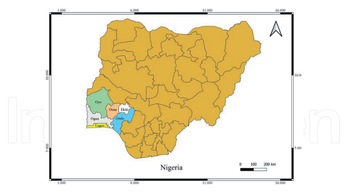
Figure 1. Map of Nigeria showing the Southwestern region and its states.

raining season-which ranges from April to October [1]. The region has an annual temperature range of 21 to 29°C, with relatively high humidity. The annual rainfall varies from 1150 mm in the northern part and 2000 mm in the southern areas [2].