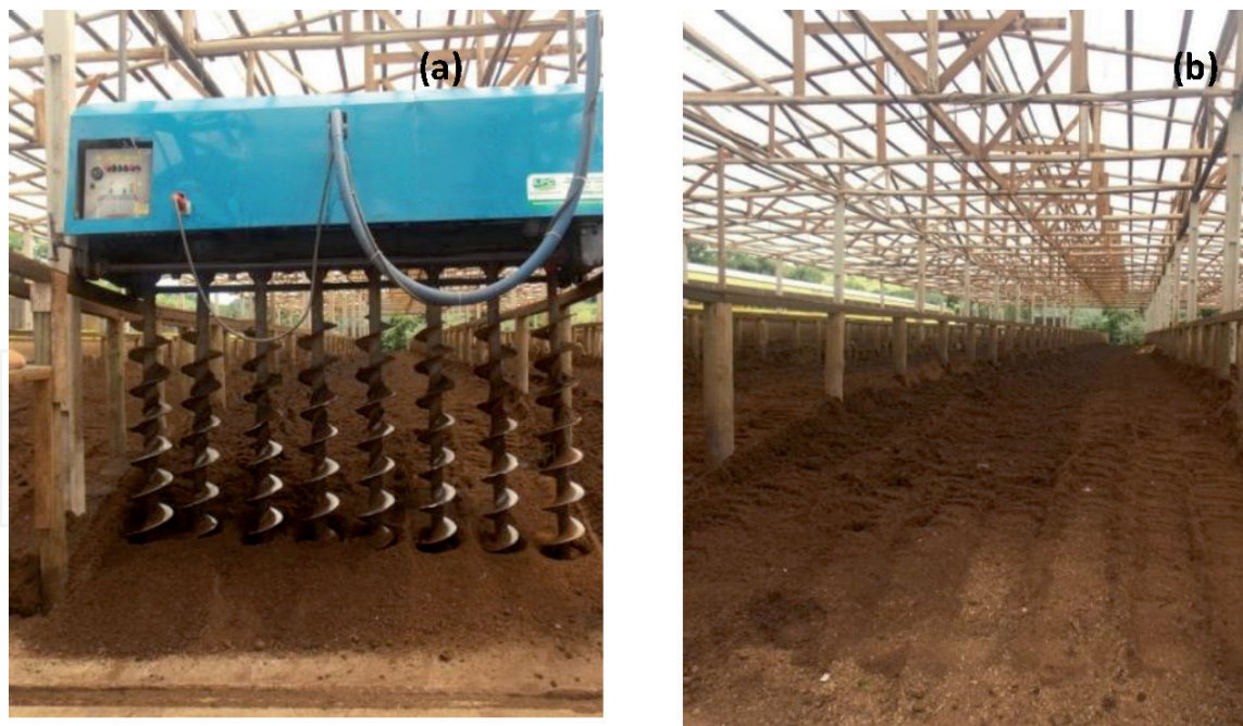
Figure 3. Mechanized composting system of swine effluents (a) [58], shaving bed after effluent injection and revolving (b) municipality of Concordia, SC.

4 antibiotics (florfenicol, sulfadimetoxin, sulfametazin and tylosin) [51] during the composting process of domestic effluents, approximately 95–99% of antibiotics were degraded after 21 days of testing. Antibiotic decline [53] was evaluated (tetracycline 96%, 99% sulfonamides and macrolides 95%) during the composting process, [48], after 35 days of bench-scale composting, they did not detect the presence of antibiotics from the Sulfonamide Group (Sulfametazin (SMZ) and Sulfametoxazole (SMX)).