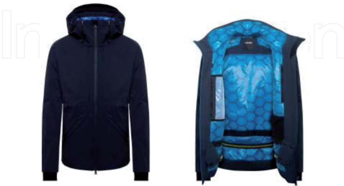
Figure 5. Graphene-based jacket.

The smart denim jacket designed by Levi's turns a portion of the fabric on the sleeve into a touch-sensitive remote control for phones to be helpful in everyday life. This is a second version of their Jacquard smart jacket first introduced in 2017.