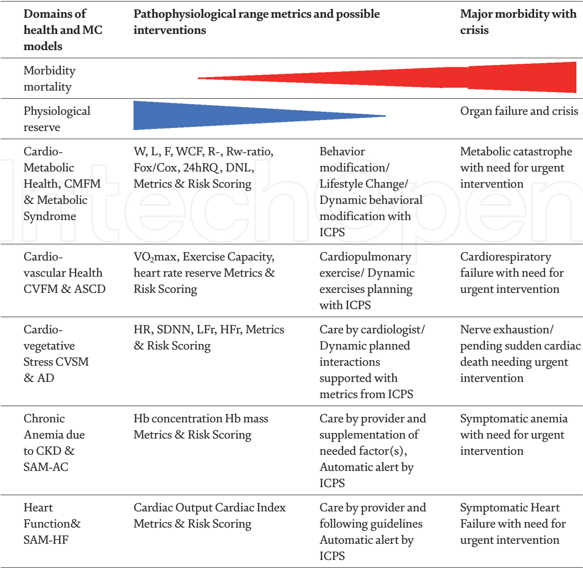
Table 1. ICPS medical software.

for improvement. The diagram shows also major tools for how vanishing physiological reserve in each health category could be improved and potentially help restore health. ODI’s leap ahead innovation is to use ICPS to collect highly impactful data, compress them into MC models, and determine and predict the model parameters which become the target for optimization of physiological functioning to reduce risk for morbidity/mortality.