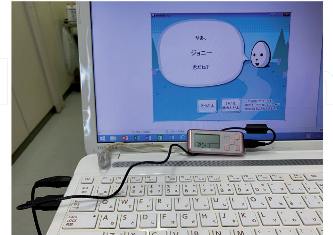
Figure 1. Citizen digital pedometer TW700, connected to a laptop computer. The pedometer was connected to a laptop computer through a USB cable to upload steps.

It is reasonable to assume that walking quantified by a pedometer is beneficial for the management of impaired glucose tolerance not only in non-pregnant subjects but also in pregnant subjects. Dahjio et al. reported a study on pedometer-monitored walking for the management of glucose in non-pregnant individuals. They examined a 12-week aerobic exercise training program monitored with a pedometer in type II diabetic Cameroonian women [33]. The subjects showed a significant reduction in body weight, waist circumference, and mean glycaemia after 12 weeks of the program. However, no study so far has reported the use of a pedometer in pregnant women with impaired glucose tolerance. Hence, we examined the feasibility of using a pedometer to quantify the exercise intensity and the relationship between the amount of exercise and carbohydrate metabolism in pregnant women with impaired