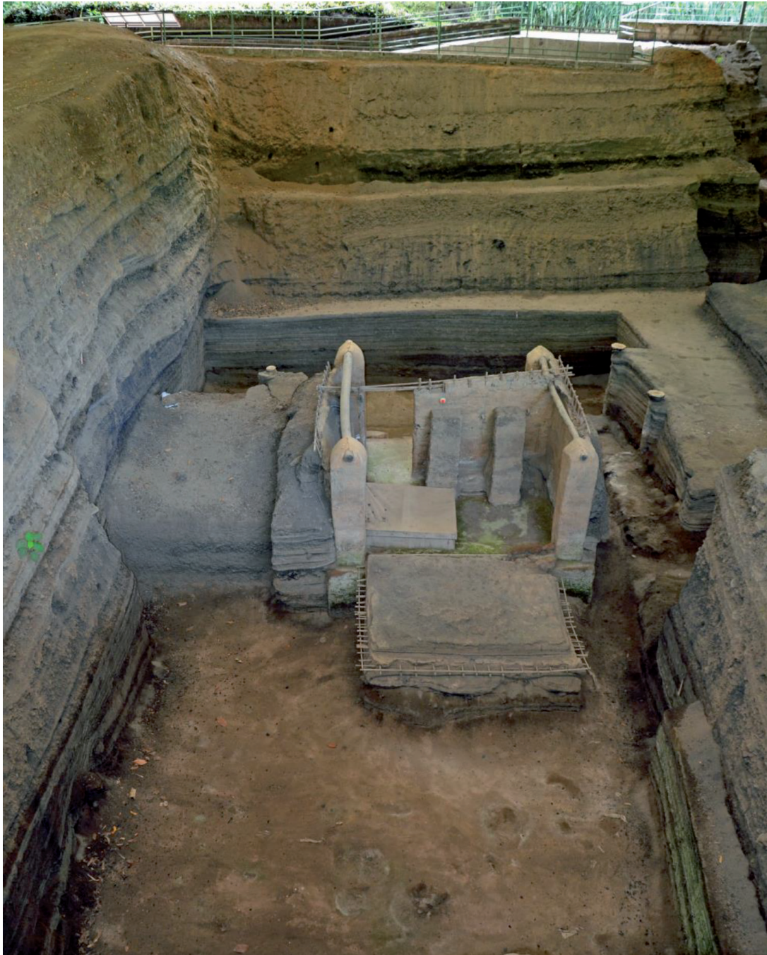
Figure 2. Structure 4, the storehouse for household 4, buried under 5 m of volcanic ash from Loma caldera volcanic vent, looking north. All walls withstood the forces of the eruption, except the southern wall, that fell to the south.