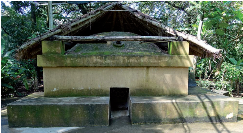
Figure 4. The replica of the sauna, in the public access part of the archeological park. The architectural firm accurately reconstructed the original ancient building, so visitors can enter it and experience the acoustic phenomena.