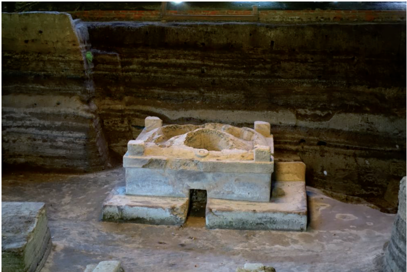
Figure 3. Structure 9, the sauna, with two holes in the domed roof created by lava bombs. The stubby columns in the corners supported beams and a thatch roof that protected the earthen architecture from the elements.