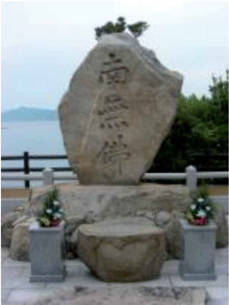
Figure 1. First Ossuary. The 674 people who passed away between 1901 and 1936 are buried here. The oldest remains are dated June 12, 1901 (Oshima Sanatorium opened on April 1, 1901).