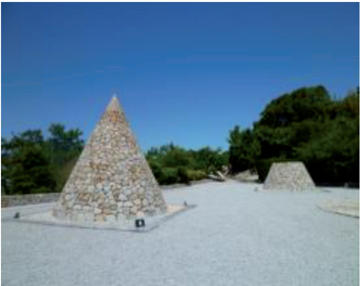
Figure 4. Dance of the Wind. The title, “Dance of the Wind,” is based on the following wish: “at least let the spirit of my dying words ride the wind away from the island, freely released to return to my native home.” It was built by approximately 1000 volunteers in 1992. The pointed conical monument on the front represents “everything in the heavens and space above,” while the conical platform in the back represents “everything under the sun on earth.” The round area with flagstones is a stage on which souls are thought to dance with the wind before setting off to their hometowns. The conical monument contains ashes of many individuals that did not entirely fit within their funerary urns.

This study is divided into two parts. In the first report, we describe the conceptual structure of “spirituality” and the relationship between spirituality and QOL. In the second report, we show the spiritual pain and spiritual well-being of Hansen’s disease survivors through a review analysis and discuss spirituality and QOL. A table content of the first and second report is presented in Table 1 as an overview of the entire study.