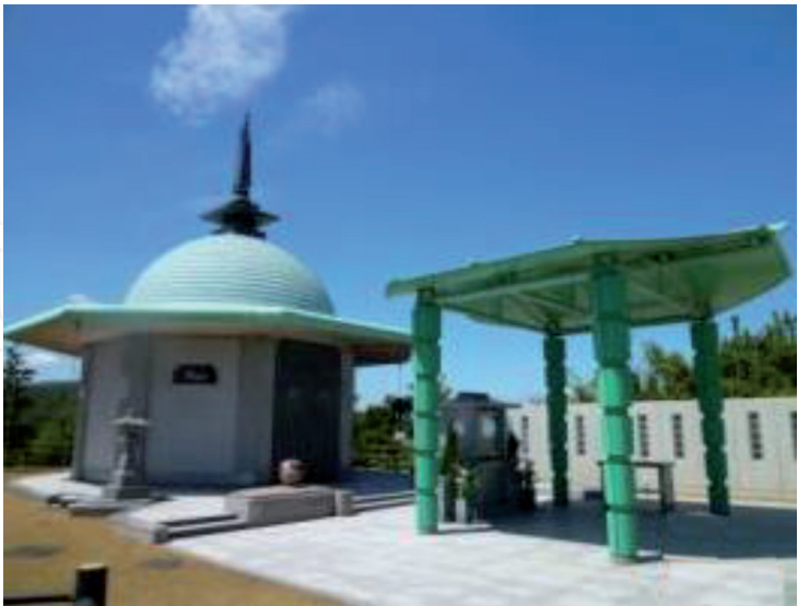
Figure 2. Ossuary. A majority of the residents lived here for the rest of their life and were cremated here. Those whose remains were not returned to their hometowns are kept in this ossuary on the island.

sufferings and went on to become latter-stage elderly living vividly with purpose of life, even though it was minor. Is it possible to develop an individuality wherein one can experience spiritual well-being despite having experienced spiritual pain? This is an important theme, as spiritual well-being constitutes a part of QOL.