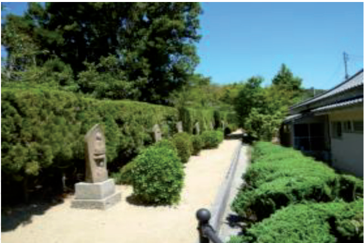
Figure 3. The 88-statue circuit within Oshima Seisho-en property. A total of 88 stone images are enshrined on the property to permit the 88-temple Shikoku pilgrimage to be carried out on-site.