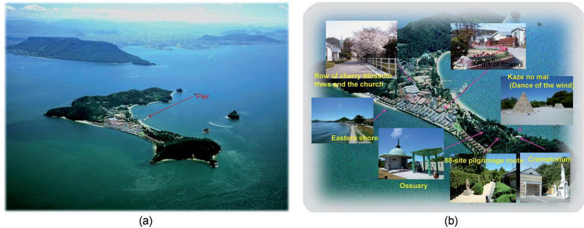
Figure 7. (a) View of the entirety of the Ōshima Seishoen (in the background are Yashima and Takamatsu harbor); and (b) view of Ōshima Seishoen.

useful for people who are currently suffering. (6) The nurses at the sanatorium were the listeners of their life review. This book has also recorded the nursing practices. This interaction also increased the ability of the nurses to listen, empathize, understand, and deepen the relationship between them and the survivors. Through this, the nurses also got the opportunity to care for the survivors who do not have their own children. (7) The book was made by using qualitative and inductive methods in order to arrange the composition and express it in a narrative tone, therefore even elementary students can read it to learn about human rights. (8) New patients of Hansen's disease have been found only in developing countries like India, Brazil, and Indonesia. They account for about 80% of the total patients. The developed countries are not concerned about the disease. We hope that by increasing the awareness in developed countries, through the stories of the survivors, the wisdom and strength for solving problems in future will be shared.