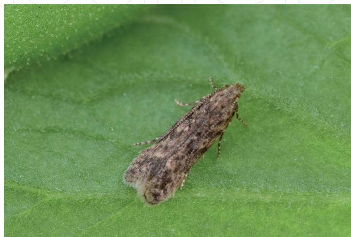
Figure 1. Adult moth of tomato leafminer, Tuta absoluta.

Tuta absoluta was originally described as Phthorimaea absoluta (Meyrick, 1917) in Peruvian Andes. The genus was changed to Gnorimoschema [11] and then to Scrobipalpula [12] and Scrobipalpuloides [13]. Povolny [14] corrected the currently