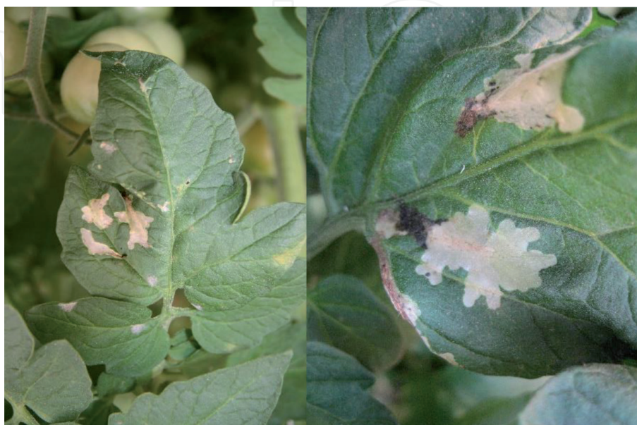
Figure 4. Symptoms of damage appear as mines and galleries on tomato leaves caused by feeding of T. absoluta larvae.