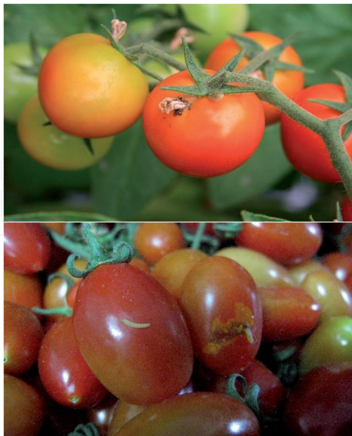
Figure 5. Tunnels in ripe tomato fruits excavated by the larvae of Tuta absoluta.