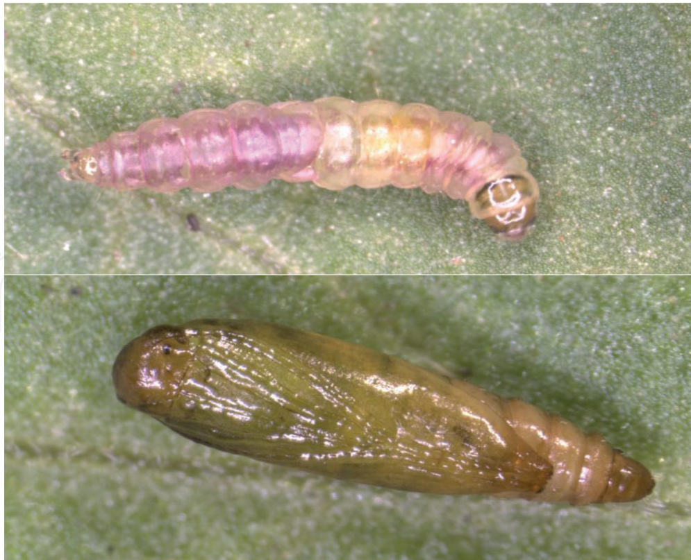
Figure 2. Larva (top) and pupa (bottom) of Tuta absoluta.

used name Tuta absoluta . The EPPO code and phytosanitary categorization for T. absoluta are GNORAB and EPP A1 action list no. 321, respectively [8].